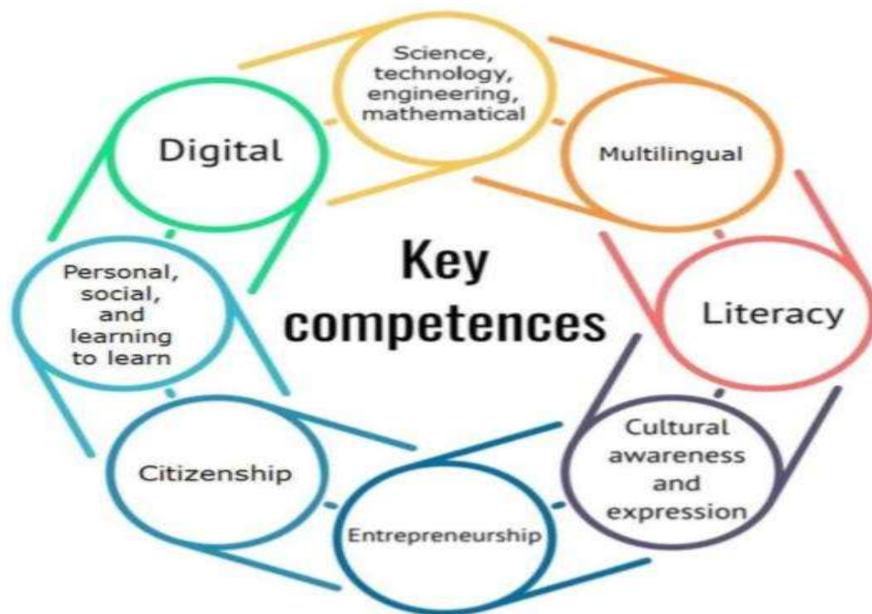
Figure 2: Key Competences of AI in Education:

15.Community Partnerships: Collaborate with tech companies, universities, and other organizations to stay updated on the latest AI developments and gain access to resources and expertise.