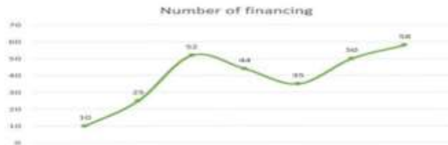
Fig. 2. Number of financing on childhood education.