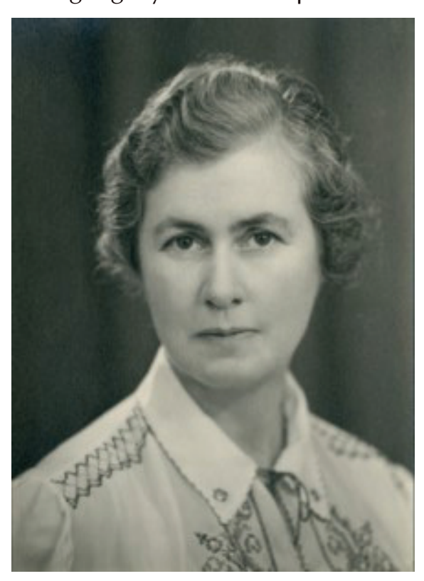
Figure 4 Gertrude Caton-Thompson. Bierbrier, M. L. (2019). Who was who in Egyptology. London: The Egypt Exploration Society. 192

Another exemplar of pioneering British women in Egyptology, Gertrude Caton-Thompson (1888-1985) stood out as a prominent British archaeologist whose professional trajectory discipline significantly influenced the Egyptology. Born in London on the 1st of February 1888, she commenced a voyage that would reshape archaeological methodologies within this domain.<sup>43</sup> Caton-Thompson's pioneering spirit led her to engage in excavations across varied landscapes, from the ancient sands of Egypt to the historical depths of Malta, Rhodesia, Zimbabwe, and southern Arabia. Her discoveries, including a predynastic village in He and two neolithic cultures, reshaped our understanding of Egypt's ancient past. Beyond her groundbreaking excavations, Caton-Thompson's legacy is also defined by her role in inaugurating the first comprehensive archaeological and geological survey of the North, a monumental undertaking that set new standards for archaeological research.44