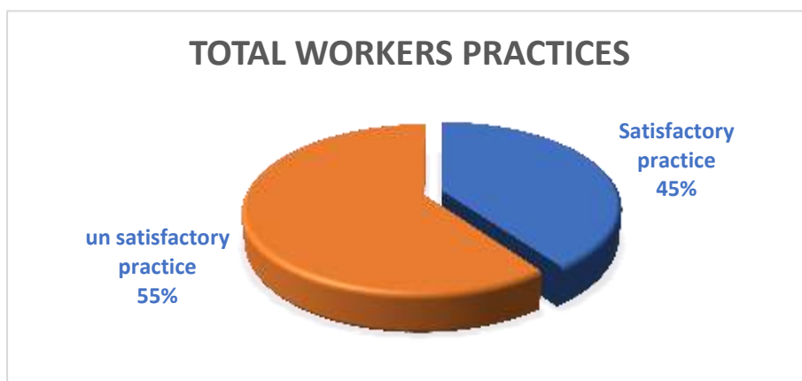
Figure (3): Percentage Distribution of the Studied Worker's Total Practices regarding Prevention of Lead Pollution (n=100).

Fig (3): Shows that, 45 % of the studied worker had a satisfactory level in total practices regarding prevention of lead pollution. While 55 % of them had unsatisfactory total practices regarding the prevention of lead pollution.