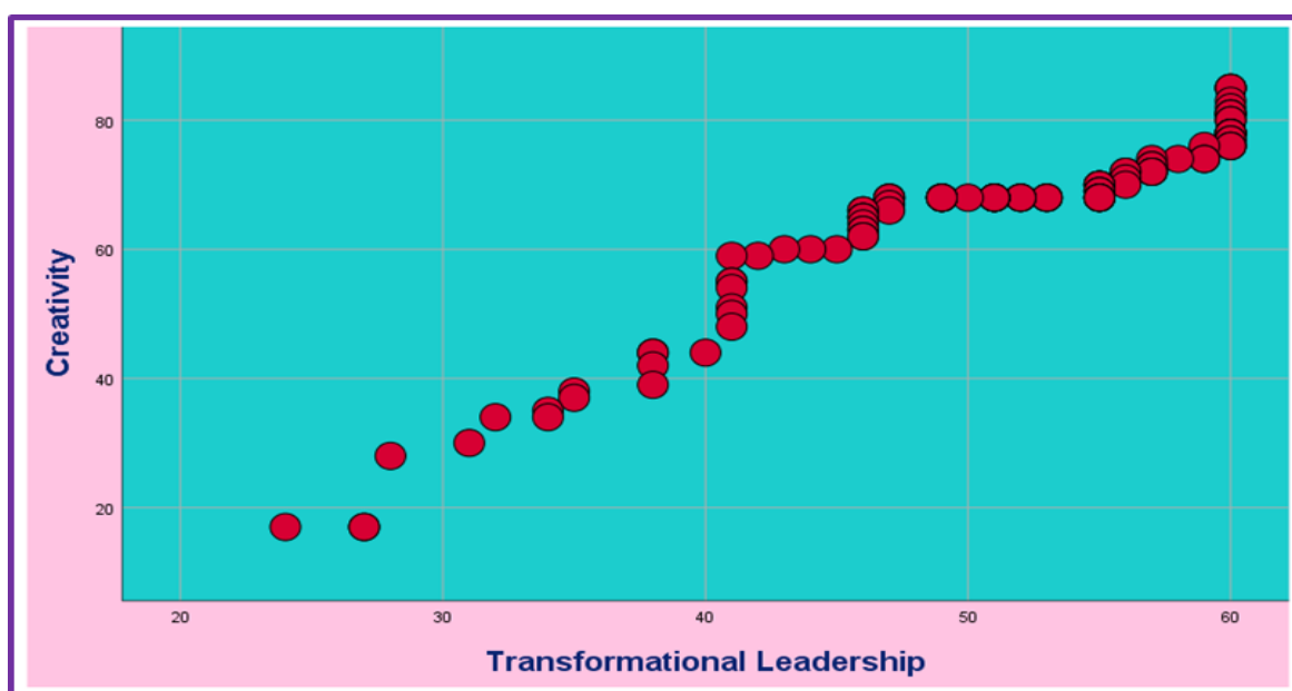
Figure (3): Scatterplot between nursing teaching staff's transformational leadership and nursing student's creativity

Fig (2) illustrates that more than half (55.3%) of the studied nursing student have a high level of creativity, followed by one-quarter (25.2%) of the studied nursing students have a moderated level. While the minority (19.4%) of them have low level. In addition to, presence of a highly statistically significant difference between levels of creativity.