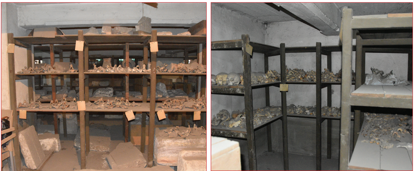
Figure2. Pre-curation of Skulls and Hips at room 3 (a) Hip bones placed on the central south shelves (b) Skulls placed on the south 2 shelves.

Skulls, pelvises, and mandibles were grouped separately, while some bones were labeled with individual or cemetery numbers to facilitate the reconstruction of complete skeletons. A few complete skeletons were identified and segregated. While some collections were well-preserved and stored in wooden boxes, others were housed in deteriorating containers filled with various materials, including sawdust, straw, sugarcane, and cotton. Notably, some skeletal materials were wrapped in antique newspapers, while others were wrapped in plain brown paper (Fig. 3). Despite these challenges, the majority of the remains were successfully salvaged, totaling approximately 9,000 skeletal and mummified remains from both rooms. As the ongoing survey progresses, it is anticipated that several thousand additional remains will be incorporated into this initial assemblage.