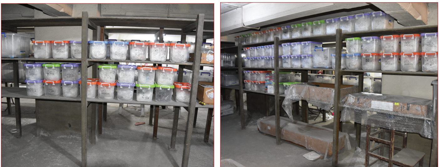
Figure 7. Storage system in room 3 central north shelves.

A primary objective of the project was the implementation of effective storage protocols for the skeletal remains. To this end, bones were meticulously wrapped in acid-free tissue paper and bubble wrap before being placed in custom-designed plastic containers. Larger containers, measuring 44x39 cm, were utilized for complete skeletons and skulls, while smaller containers were reserved for isolated skulls and pelvises. Internal dividers were employed to separate individual remains or skeletal elements. Mummified remains were similarly protected, using cardboard covered in acid-free tissue paper. For complete mummies, specialized wooden boxes were constructed to accommodate their specific dimensions. All containers were clearly labeled and organized on numbered shelves, in accordance with the Egyptian Museum's established storage practices (see Fig. 7).