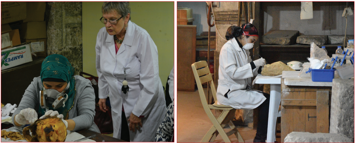
Figure 6. Conservation steps for both human remains and basket coffins

A primary objective of the project was the implementation of effective storage protocols for the skeletal remains. To this end, bones were meticulously wrapped in acid-free tissue paper and bubble wrap before being placed in custom-designed plastic containers. Larger containers, measuring 44x39 cm, were utilized for complete skeletons and skulls, while smaller containers were reserved for isolated skulls and pelvises. Internal dividers were employed to separate individual remains or skeletal elements. Mummified remains were similarly protected, using cardboard covered in acid-free tissue paper. For complete mummies, specialized wooden boxes were constructed to accommodate their specific dimensions. All containers were clearly labeled and organized on numbered shelves, in accordance with the Egyptian Museum's established storage practices (see Fig. 7).