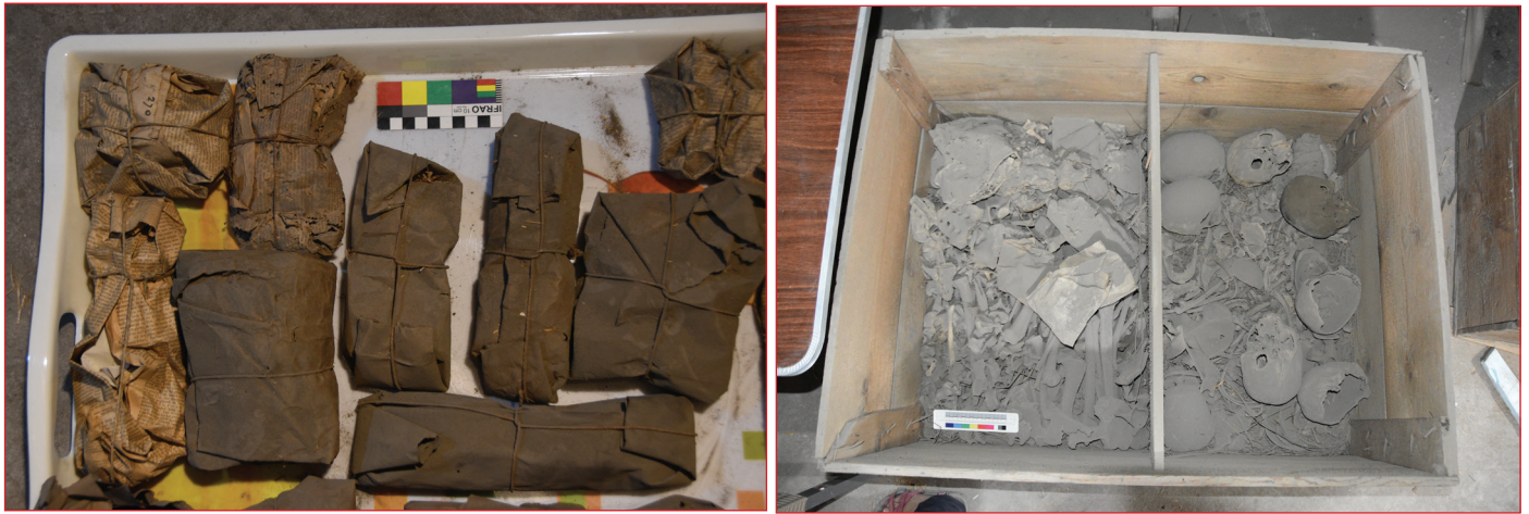
Figure3. Historical Context of the Collections (a) Skeletal remains from Emery's Nubian excavations (1929-1931), wrapped in plain brown paper and newspapers. (b) Skeletal materials from Petrie's Deshasha excavations (1897).