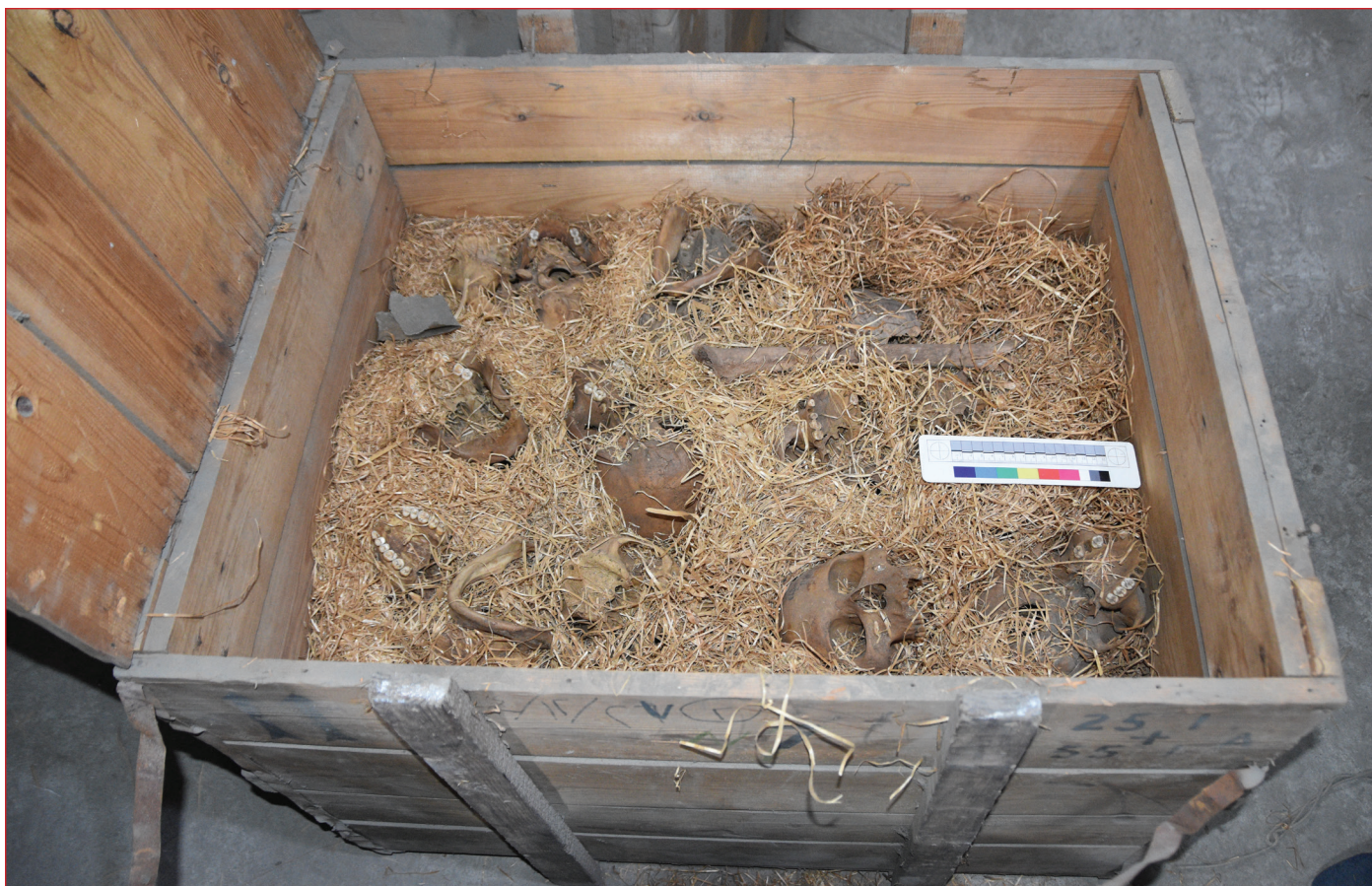
Figure 13. Edfou Excavation of 1939: Box TR 25/1/55/1A.