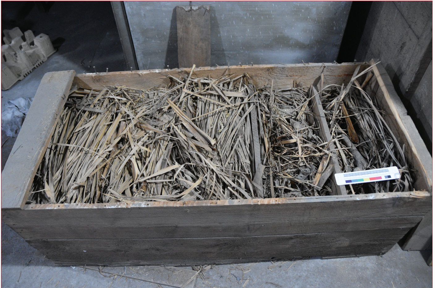
Figure 11. Box TR 9/11/14/2, which contained human remains recovered from Petrie's excavations (1898-1899) at the sites of Hu and Abadiya.