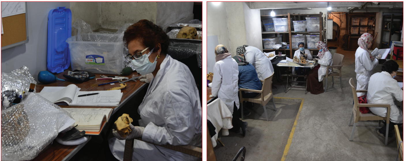
Figure 5. Documentation and analysis at room 3