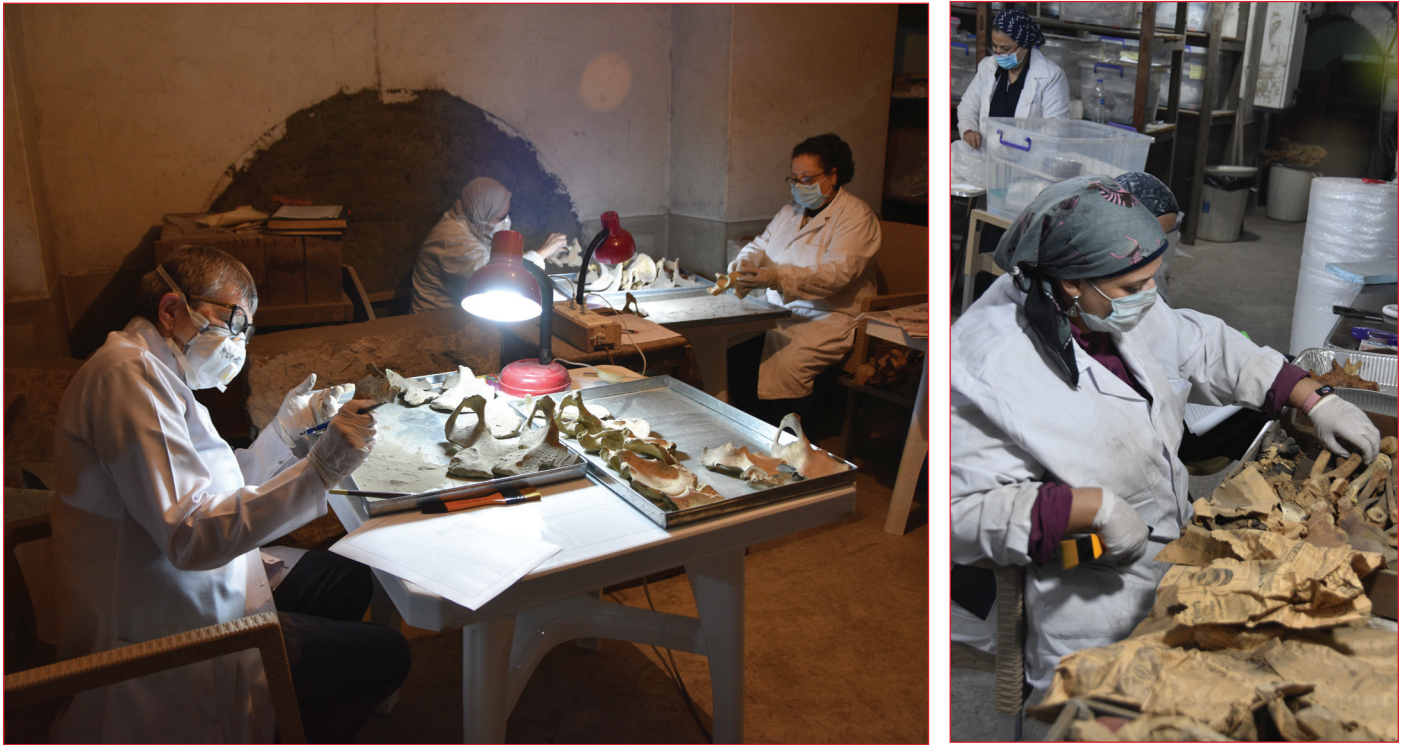
Figure 4. Cleaning process for both newspapers and human remains