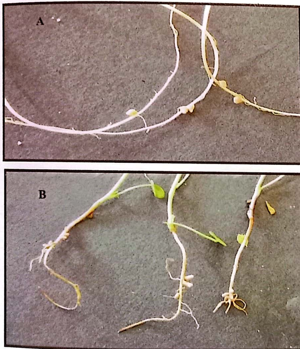
Fig. (1). Nodules induced by strain Ochrobactrum (A) and Cellulosimicrobium (B) in Medicago sativa .

The degradation capacity of the two genera indicated that the percentage of residual oil in media are 28.2% and 21.9% for Ochrobactrum and Cellulosimicrobium , respectively.