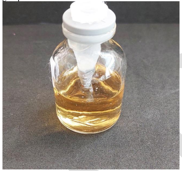
Figure 1: Experimental Apparatus.

uncontaminated condition. The results of positive bacterial growth in the study groups after 30 days of E. faecalis inoculation are presented in (Table 1 and Figure 2), while (Table 2 and Figure 3) display the time to bacterial growth in these groups. None of the test groups completely resisted bacterial microleakage, with such leakage predominantly occurring in the latter half of the experimental period. Notably, only one sample (10%) in the Sole apicectomy group (group1) exhibited positive bacterial growth, indicated by broth turbidity on day 26. In the standard retrograde procedure group (group2), two samples (20%) showed turbidity after an average time of 18 days (at day 15 and day 26). Post hoc comparison revealed no statistically significant difference between these two test groups.