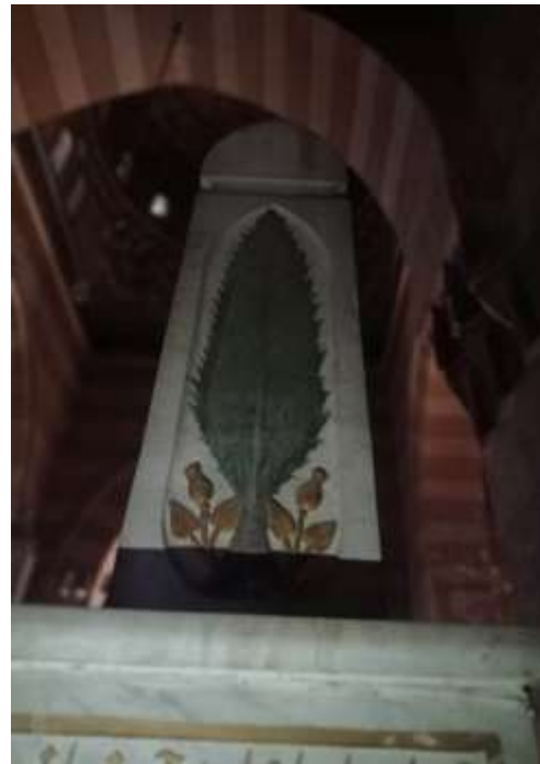
Figure (4) The back of the headstone