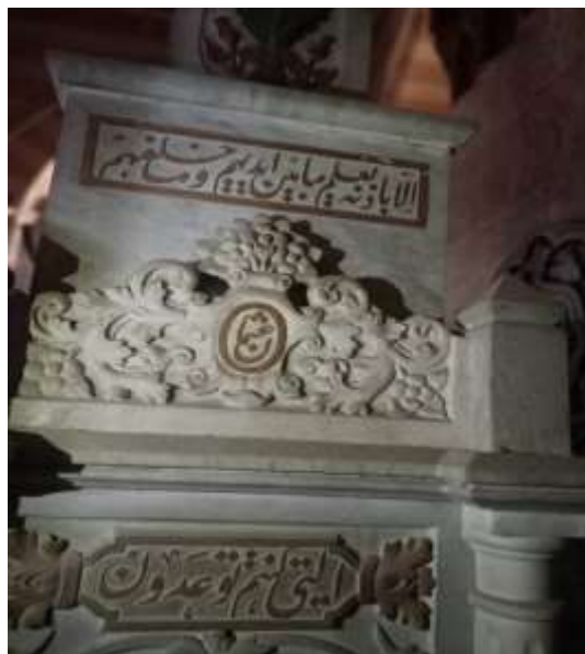
Figure (8) The back of the marble structure