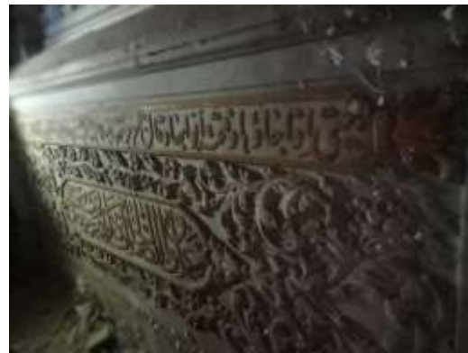
Figure (11) The left side of the lower level