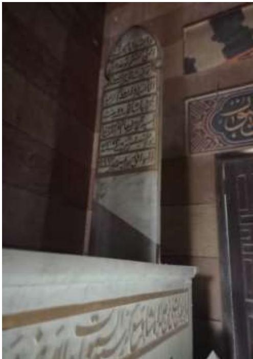
Figure (3) The tombstones of Dawlat Hanem

(وأبشروا بالجنة / التي كنتم توعدون / توفيت إلى رحمة الله / الأنسة دولت هانم كريمة / محمود باشا ثابت وبنت / السيدة فاطمة هانم محرم شاهين / يوم السبت 20 رجب سنة 1383 هـ / الموافق 7 ديسمبر سنة 1963 م)