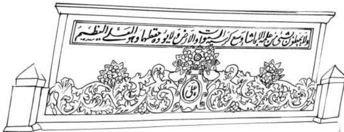
merlon of right side

The acanthus decoration also spread on the side merlons that precede the third upper level of the marble composition, which was executed symmetrically on both sides of the circular medallions containing the names (Omar, Ali). It seemed very lively, moving harmoniously, and anthropomorphic in appearance. fig. (21), in addition to the presence of two composite flowers on both sides, in the middle of the merlons is a bouquet of five-petaled roses, noting that these decorations are completely identical on the opposite side of the same level.