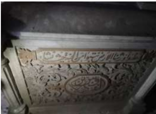
Figure (12) The lower level of the back of the composition