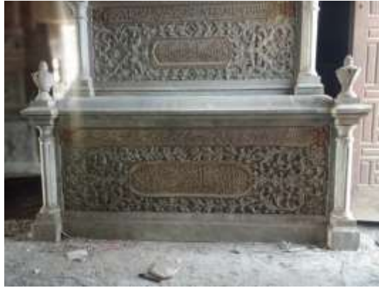
Figure (14) the middle and lower levels of the right side of the marble composition

إِنَّ الَّذِينَ آمَنُوا / وَعَمِلُوا الصَّالِحَاتِ كَانَتْ لَهُمْ جَنَّاتُ / الْفِرْدَوْسِ نُزُلًا / خَالِدِينَ فِيهَا لَا يَبْغُونَ عَنْهَا حِوَلًا