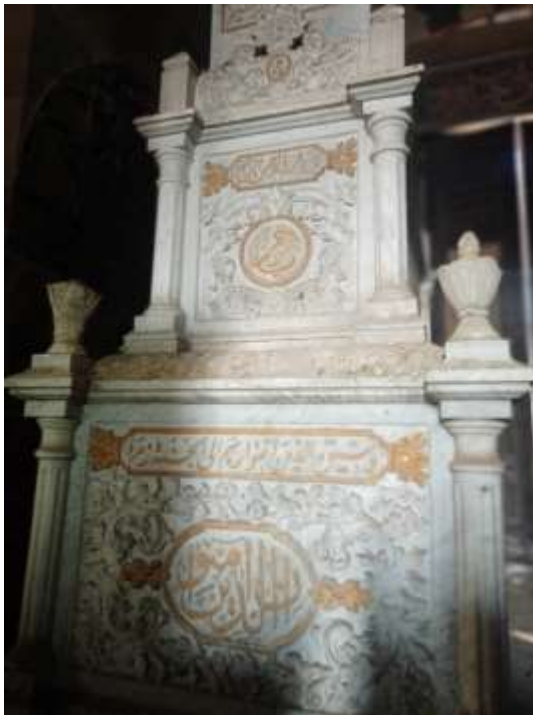
Figure (10) The front of the lower level

{وَسِيقَ الَّذِينَ اتَّقَوْا رَبَّهُمْ إِلَى الْجَنَّةِ زُمَرًا / حَتَّى إِذَا جَاءُوهَا وَفُتِحَتْ أَبْوَابُهَا وَقَالَ لَهُمْ خَزَنَتُهَا سَلَامٌ عَلَيْكُمْ طِبْتُمْ فَادْخُلُوهَا خَالِدِينَ وَقَالُوا الْحَمْدُ لِلَّهِ الَّذِي صَدَقَنَا / وَعْدَهُ وَأَوْفَرْتَنَا الْأَرْضَ نَنْبَوُا مِنَ الْجَنَّةِ حَيْثُ نَشَاءُ / فَنِعْمَ أَجْرُ الْعَامِلِينَ وَتَرَى الْمَلَائِكَةَ حَافِينَ مِنْ حَوْلِ الْعَرْشِ يُسَبِّحُونَ بِحَمْدِ رَبِّهِمْ وَقُضِيَ بَيْنَهُم بِالْحَقِّ وَقِيلَ الْحَمْدُ لِلَّهِ رَبِّ الْعَالَمِينَ}