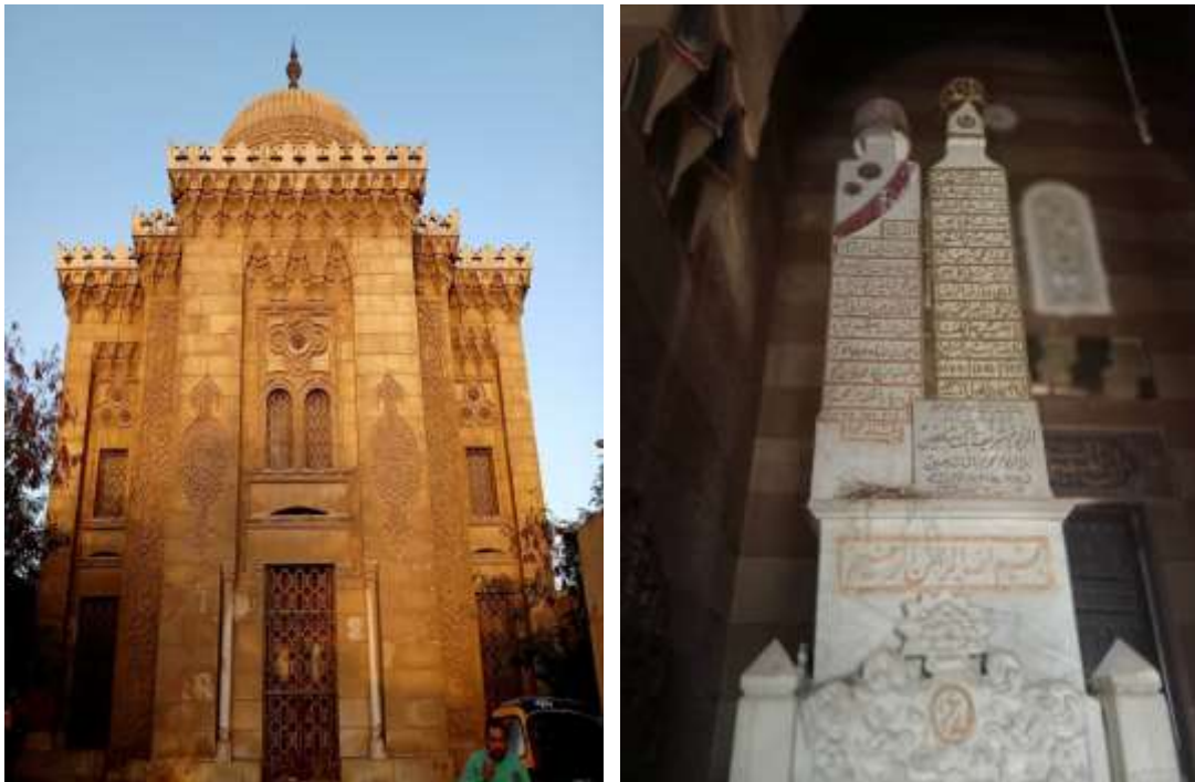
Figure (1) Facade of Sherif Pasha's mausoleum. Figure (2) The tombstones of Gülsen Hanem and her husband

This composition is located behind the marble composition of the tomb of Hassan and Zainab, the sons of Sharif Pasha, which is located directly in front of the entrance to the main mausoleum fig. (1), the marble composition of the Gülsen Hanem tomb was also erected on three levels below the tomb's headstone fig. (2).