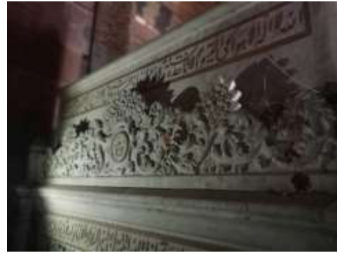
Figure (6) The merlon of left side

While this level is preceded on its four sides by an anthropomorphic floral merlon decorated with Baroque floral decorations, crowned at the top by a drawing of a radiant rose with multiple petals, and on both sides of the cresting are rectangular decorative columns that end with a pyramidal shape echoing in the four corners of this level, and in the middle of these merlons are the names of the Rightly Guided Caliphs (أبو بكر / عمر / عثمان / علي) each name on one side of the marble composition, and registered within a gilded circular frame