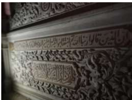
Figure (7) The left side of second level

These inscriptions were registered inside frames knotted on both sides and ending with a winged plant bundle, surrounded by plant embodied branches ears of wheat, we also notice that their frames were wider and broader in line with the elongation of the sides of the marble composition.