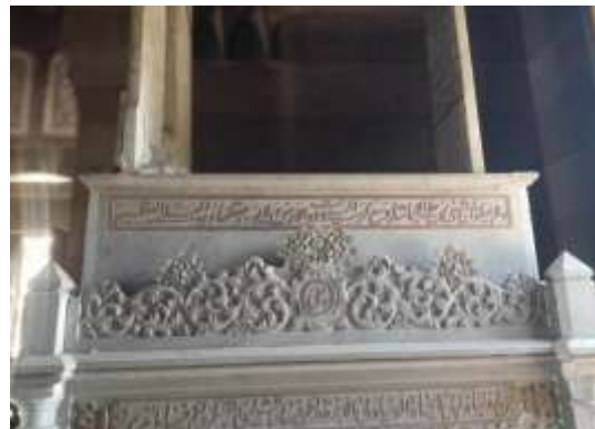
Figure (13) The right side of the top level