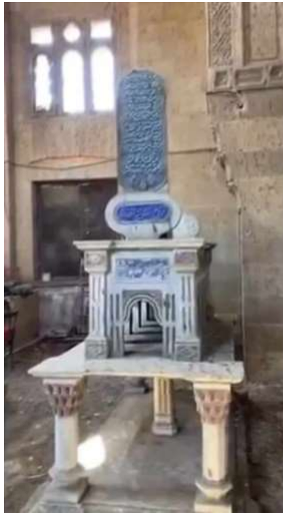
Figure (18) One of the hollow marble composition in the tomb of Shaheen Pasha al-King, father of Muharrem Bey Shaheen