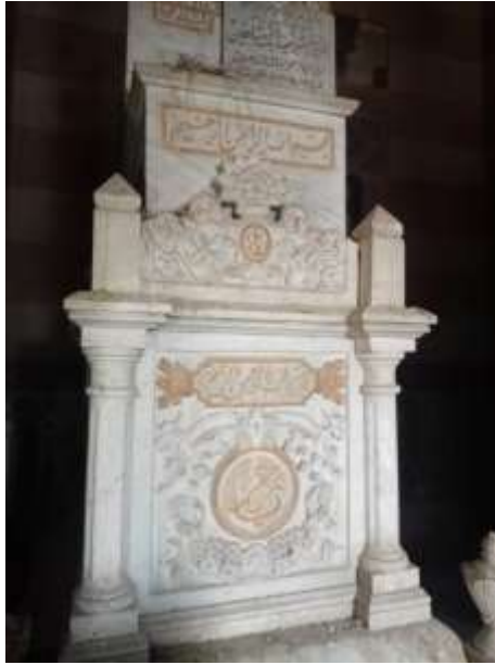
Figure (5) The façade of the marble structure

{بِسْمِ اللَّهِ الرَّحْمَنِ الرَّحِيمِ / اللَّهُ لَا إِلَهَ إِلَّا هُوَ الْحَيُّ الْقَيُّومُ لَا تَأْخُذُهُ سِنَّةٌ وَلَا نَوْمٌ لَهُ مَا فِي السَّمَاوَاتِ وَمَا فِي الْأَرْضِ مَنْ ذَا الَّذِي يَشْفَعُ عِنْدَهُ إِلَّا بِإِذْنِهِ يَعْلَمُ مَا بَيْنَ أَيْدِيهِمْ وَمَا خَلْفَهُمْ / وَلَا يُحِيطُونَ بِشَيْءٍ مِنْ عِلْمِهِ إِلَّا بِمَا شَاءَ وَسِعَ كُرْسِيُّهُ السَّمَاوَاتِ وَالْأَرْضَ وَلَا يَئُودُهُ حِفْظُهُمَا وَهُوَ الْعَلِيُّ الْعَظِيمُ}