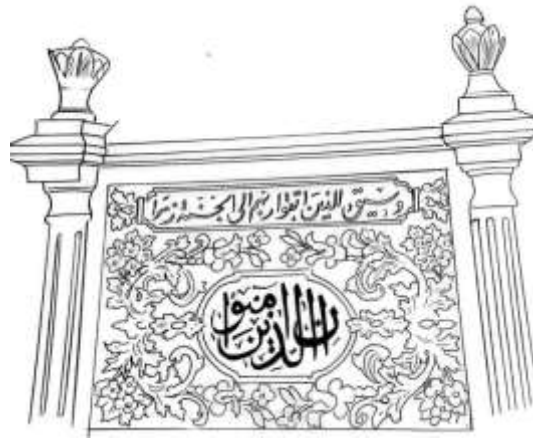
Figure (20) Front basement facade

The acanthus leaves were executed on the lower level of the façade of the marble composition in a symmetrical and opposite manner, and they wrapped around the oval frame in a way that suggests movement and vitality, and from the acanthus leaves sprouted plant branches from which lotus flowers emerged in the form of four-petal rosettes. As for the four corners of that space the square was filled with four large flowers, perhaps of the Saba' palm flower, executed in the form of an axis, and the same decorations were executed on the opposite façade of the marble composition at the same level, fig. (20).