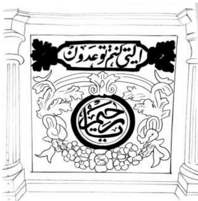
Figure (24) Decorations of the middle level of the back side

While the square area at the back of the middle level around the circular medallion in the middle is decorated with decorations of acanthus leaves, the circular bowl is surrounded at the top, while the lower area is decorated with two vegetal branches of four-petal roses, appearing at the bottom with a large six-petal rose fig. (24), with a note the repetition and similarity of the decorations of these levels on the opposite side, so the study contented itself with transcribing the decorations for one side of the multiple levels to avoid repetition.