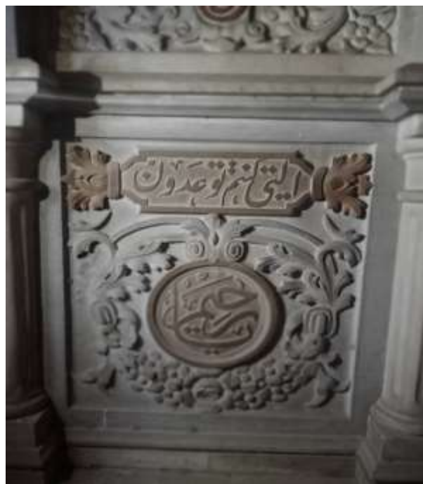
Figure (9) The middle level of the back of marble composition