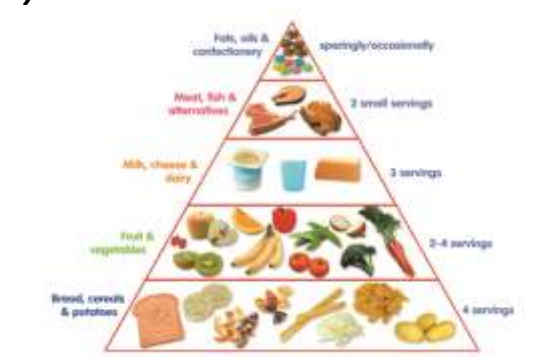
Figure 1: Nutritional Pyramid

A diet incorporating appropriate portions of these food groups ensures nutritional balance and supports overall health (Fletcher, 2023, p. 87). This principle is visually represented in the nutritional pyramid (Figure 1).