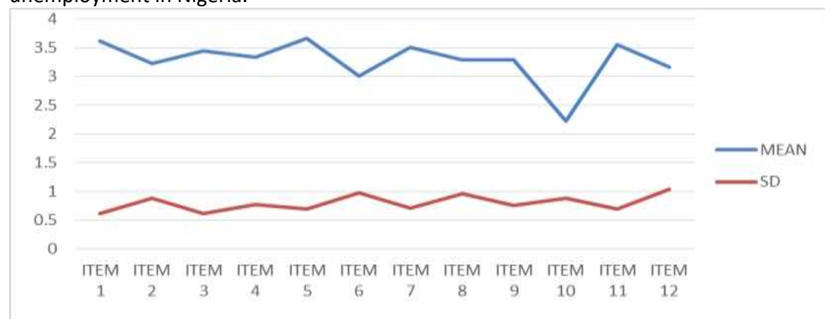
Figure 1: Mean response of Adult and Youth on the contribution factors to the youth unemployment in Nigeria.

The data presented in table 1 on factors that affect youths unemployment in Nigeria, revealed that the respondent agreed with all the items with mean score ranging from 3.17 - 3.67 except item 10 which has mean score of 2.22. This signifies that most of the respondents agreed that all the factors are responsible for youth unemployment in Nigeria.