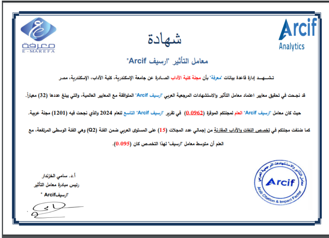
Figure (1) the certificate awarded to The Journal by the “Ma’rifa” database managers.

I am pleased to announce the continuous development of our Journal , and the good news. The Journal of the Faculty of Arts has succeeded in achieving the standards for adopting the Arab Arcif impact factor and reference citations compatible with international standards, which numbered (23) standards, and the Journal's Arcif factor reached (0.0962) in the ninth Arcif report for the year 2024, in which (1201) Arab journals succeeded. The Journal was also classified in the field of comparative languages and literature out of a total number of (15) journals at the Arab level within the category (Q2); as shown in the following certificate: