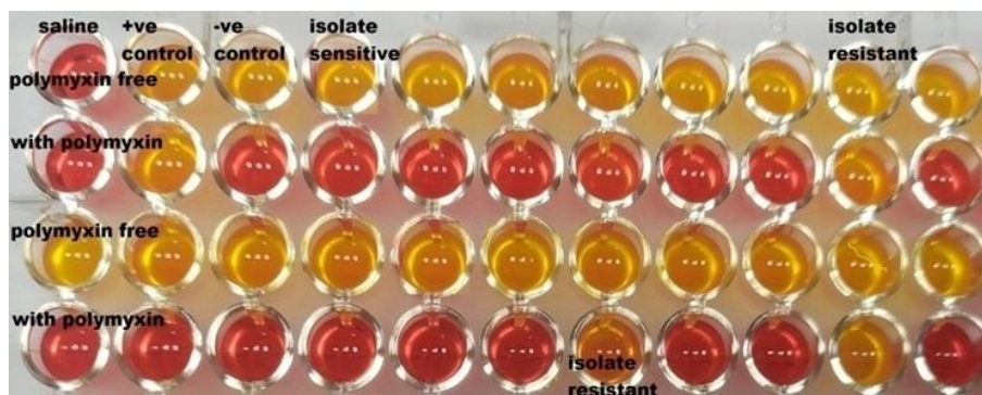
Figure (1): Polymyxin NP test in a Microtitre plate show first and 3 rd row contain polymyxin free solution, the 2 nd row contains polymyxin NP solution. first well in the first and 2 nd row were inoculated with saline, the 2 nd well in the first and 2 nd rows were inoculated by positive control strain, first and 2 nd rows were inoculated with saline, the 3 rd wells in the first and 2 nd rows were inoculated by negative control strain, the 4th wells in the first and 2 nd rows were inoculated by tested isolate and so on. color change from red to yellow or red to orange indicate resistant bacterial growth and positive polymyxin NP test.