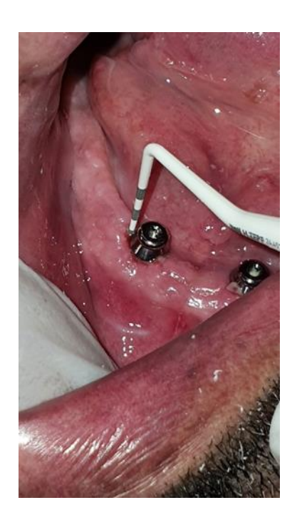
Figure 1: Measurement of marginal bone loss distally Figure 2: Measurement of marginal bone loss mesially