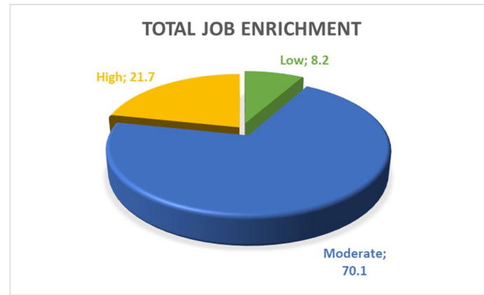
Figure (3): Distribution of Total Job Enrichment Level among the study subjects (n=415).

Figure (2): present that (66.0%; 51.1%; 48.9%; 41.0% & 40.5%) of nursing staff have "moderate" level regarding dimensions of job enrichment "Autonomy, Skill variety, Feedback ,Work tasks significance and Tasks identity" respectively.-while (37.8%; 36.6%; 31.6%; 19.5%, &14.2%) of nursing staff's had "high" level in Job enrichment dimensions" Feedback, Skill variety, Work tasks significance, Tasks identity and Autonomy" respectively, and (40%; 27.5%; 19.8%; 13.3%, &12.3%) of nursing staff's had "low" level regarding dimensions of job enrichment "Tasks identity, Work tasks Significance, Autonomy, Feedback and Skill variety" respectively.