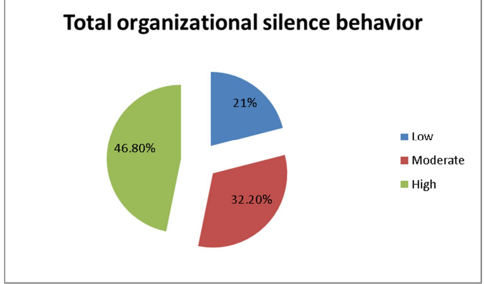
Figure (3): Percentage distribution of total nurse's organizational silence behavior (no.=205).

Figure (3) illustrates that (46.8%) of nurses have high level of organizational silence behavior, (32%) of them have moderate level of organizational silence behavior, while (21%) of them have low level of organizational silence behavior.