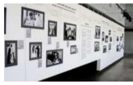
Figure 3. Display of Culture between the local and international global mediums in Qasr Al Muwaiji Museum