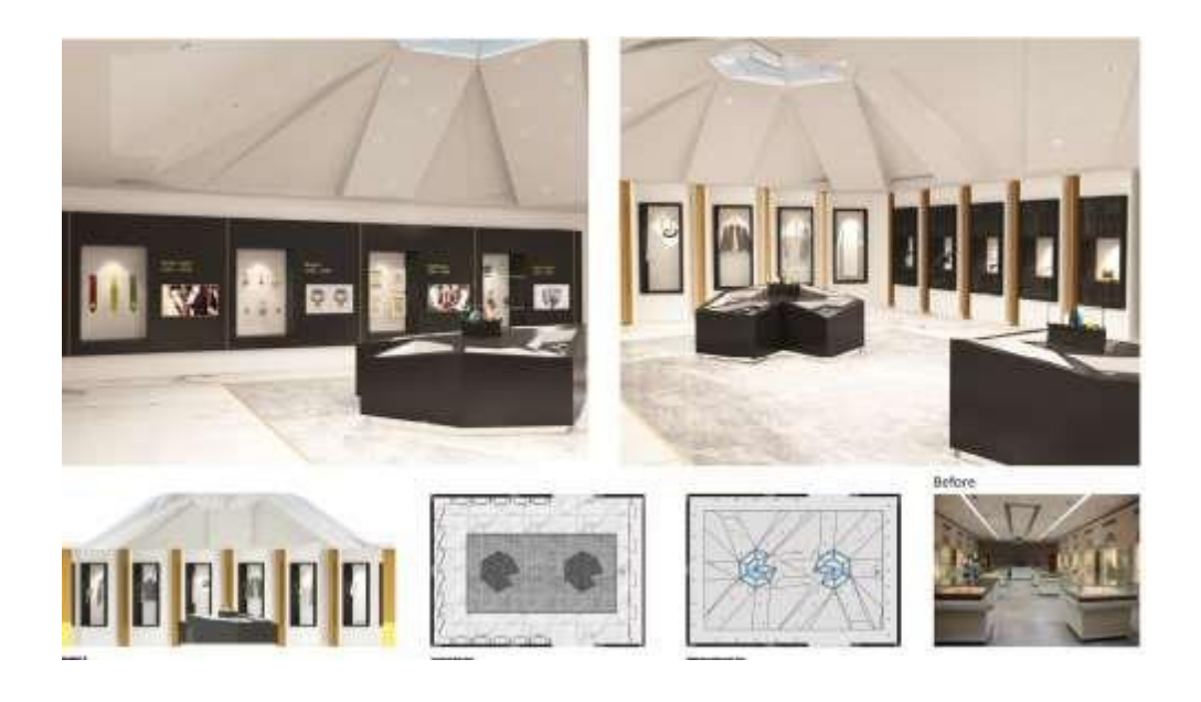
Figure 14. Examples of new form of Display Area for Collectibles within proposed museum spaces