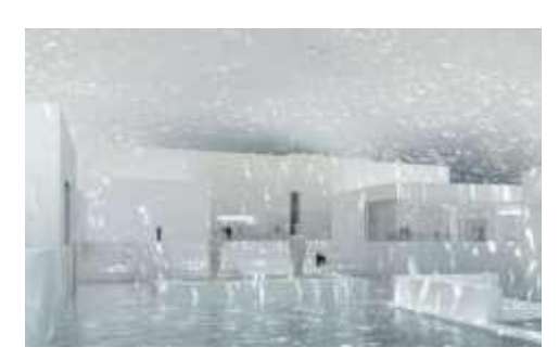
Figure 4. Digital mediums presenting the Abu Dhabi Louvre and further developments in Manarat Al-Saadiyat