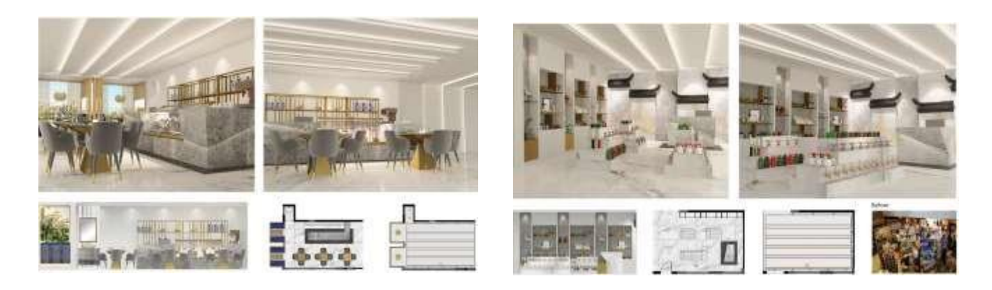
Figure 16. Examples of new form of cafe & gift shop within proposed museum spaces