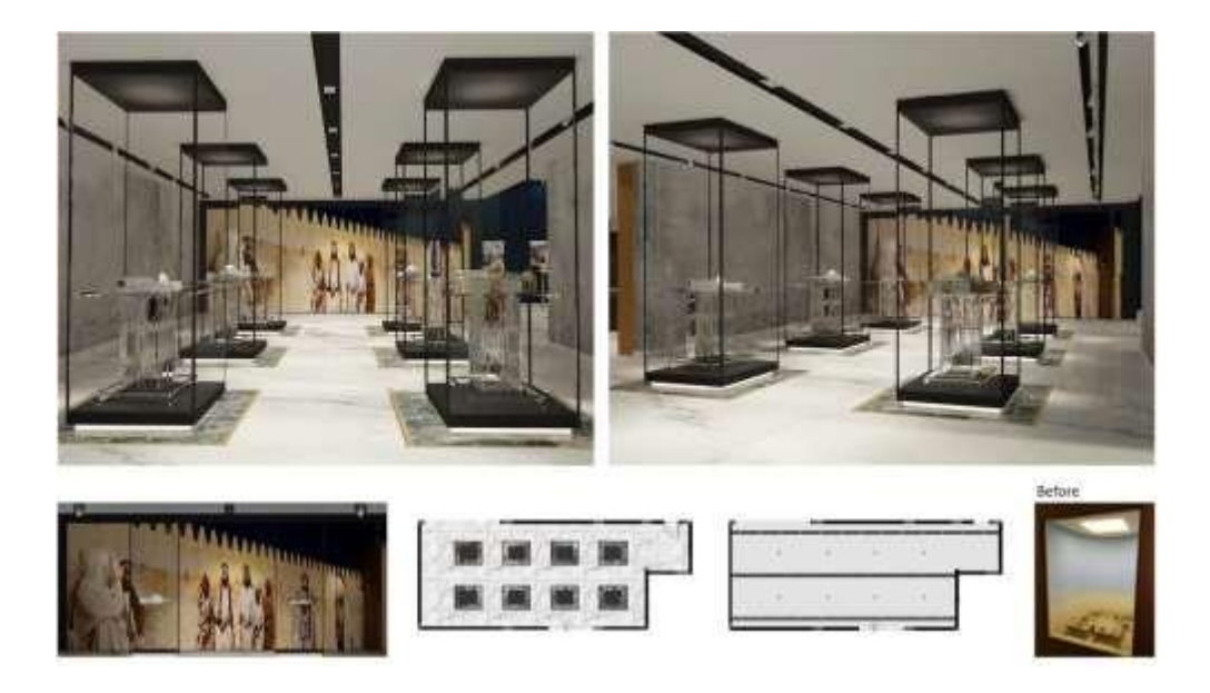
Figure 15. Examples of new form of Display Area for modeling within proposed museum spaces