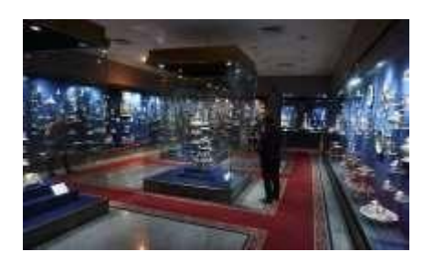
Figure 9. Abdeen Palace Museum - Cairo - Egypt

family trees of the age of decades. Furthermore, it shows how the king controls the country and manages its affairs