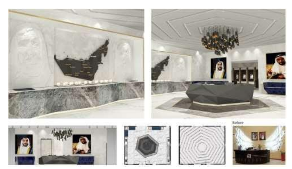
Figure 13. Examples of new form of reception within proposed museum spaces