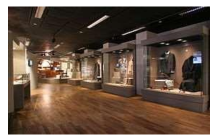
Figure 8. Anwar Sadat Museum, Egypt