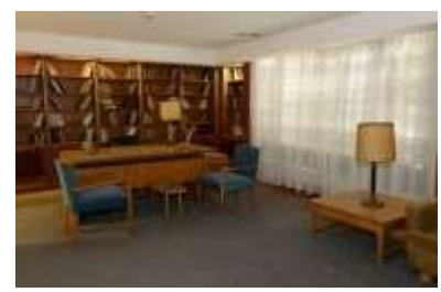
Figure 7. Jamal Abdul Nasser Museum,