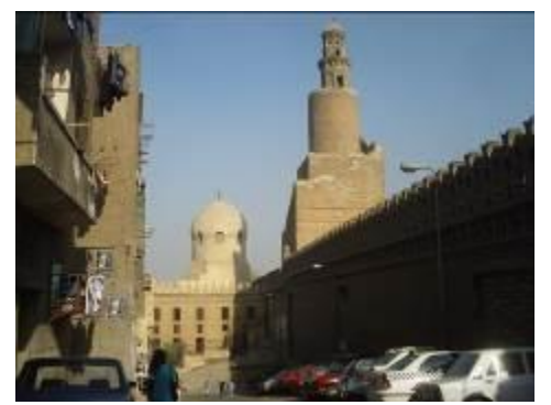
Figure 1: Al-Darb Al-Ahmar District, Cairo Moez District, Cairo

- Featuring the districts of: The Citadel, Al-Moez, Al-Gamalia, Al-Fustat, Al-Darb Al-Ahmar, Tolon, Hussein, Ghoria, Magra Al-Oyoun, Al Khalifa