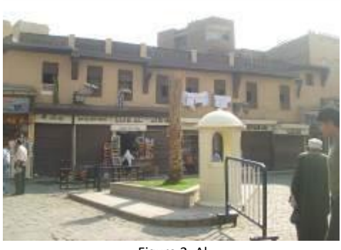
Figure 2: Al-Source:

Featuring the districts of: Champ de Mars, Eiffel tower, Le Louvre,