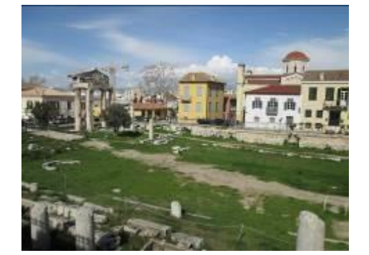
Figure 7: Acropolis district, Athens Acropolis Museum, Athens

- Featuring the districts of: Acropolis, Acropolis Museum