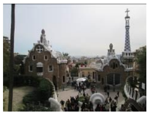
Figure 6: Works of Source:

Figure 5: Works of Antoni Gaudi, Barcelona Antoni Gaudi, BarcelonaSource: researcher researcher