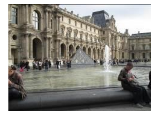
Figure 3: Stravinsky Square (Part of Notre Dame District), Paris Louvre District, Paris