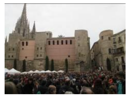
Figure 5: Works of Antoni Gaudi, Barcelona Antoni Gaudi, Barcelona