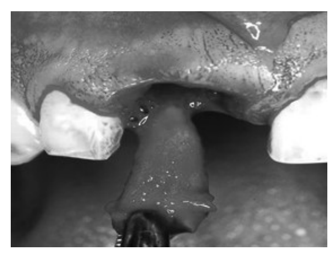
Fig2.extraction of the tooth