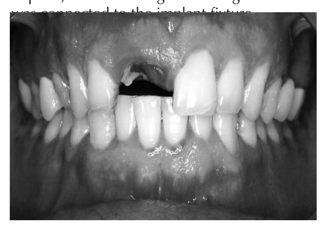
Fig1. Preoperative view.

In Group (B) sockets: the gap between the implant and the socket wall was grafted with inorganic bovine bone. After placement of the implant, non-submerged healing abutment