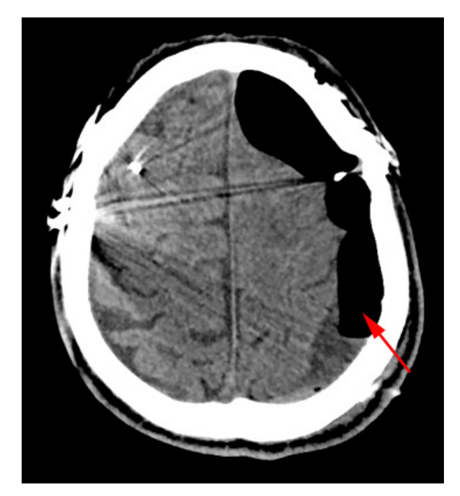
Fig 3: Postoperative CT image. Note the hematoma cavity is filled with air, marked with a red arrow.

A postoperative CT scan (Fig. 3) revealed successful evacuation of the subdural hematoma. The patient had marked improvement in motor strength. Penrose drains were removed after two days, and the patient was discharged.