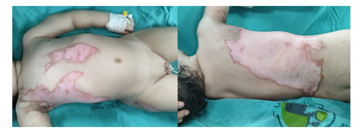
Fig. (4): Concentrated sulfuric acid patient, a 3-year-old male with scald burns about 10 % at the back, chest, and right thigh, superficial partial to deep burn, healed with repeated dressing.

Fig. (3): Female patient 12 years old with scald burns about 10% at the back and posterior aspect of the right upper limb following exposure to dormex, superficial partial to deep partial burn, healed by repeated dressing.