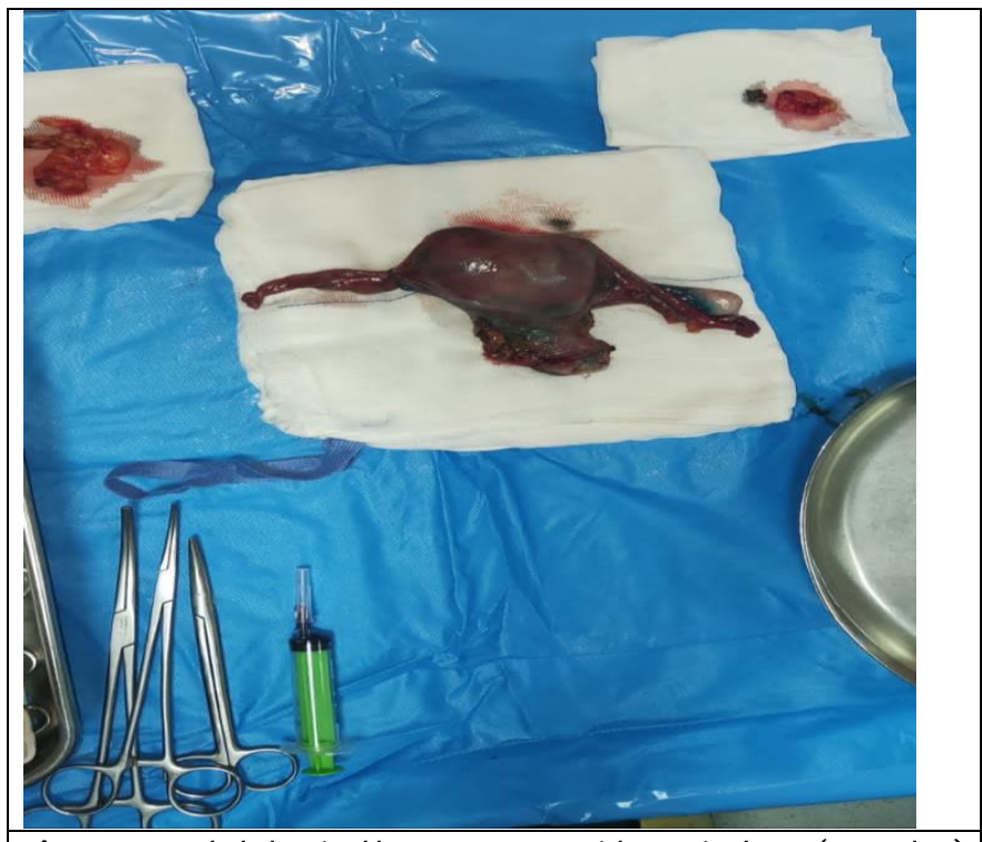
Figure 1: Total abdominal hysterectomy with sentinel LNs (Rt and Lt)

The number of excised LNs ranged from 7 to 24 with a median of 12. There was a statistically significant relation between the high level of CA-125 and deep myometrial invasion, higher disease stage, and cervical and lymph node involvement. There was a statistically non-significant difference relation between CA-125 level