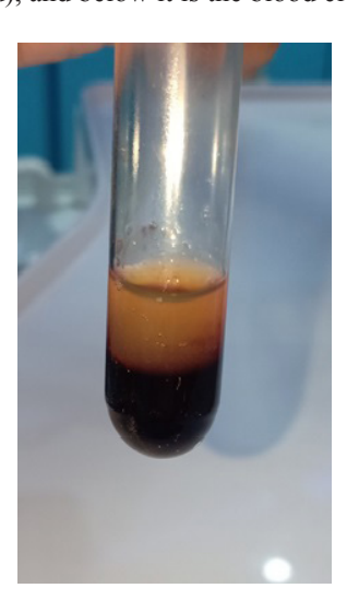
Figure (2): The glass tube immediately after collection from the centrifuge device; above: is the i-PRF (the yellowish liquid), and below it is the blood clot.

httThe upper-most liquid layer was collected with a syringe as shown in (Figure 3) and then was injected into the joint as an intra-articular injectable i-PRF through the posterior point. This study complied with the Declaration of Helsinki (revised in 1975), and with CONSORT (Consolidated Standards of Reporting Trials) principles and the regional ethical review board approved the study. All patients provided informed consent or assent as appropriate.