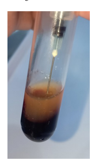
Figure (3): Collecting the i-PRF with the use of a syringe.

httThe upper-most liquid layer was collected with a syringe as shown in (Figure 3) and then was injected into the joint as an intra-articular injectable i-PRF through the posterior point. This study complied with the Declaration of Helsinki (revised in 1975), and with CONSORT (Consolidated Standards of Reporting Trials) principles and the regional ethical review board approved the study. All patients provided informed consent or assent as appropriate.