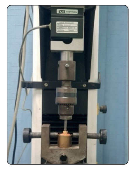
Fig. (1) A sample of a teeth specimen during the fracture resistance test using an Instron Testing Machine

Statistical analysis was performed using SPSS 16®, GraphPad Prism, and Microsoft Excel. The data were presented as mean \pm standard deviation and analyzed using Shapiro-Wilk and Kolmogorov-Smirnov tests to assess normality. Independent t-tests were used for comparisons between two groups, while one-way ANOVA followed by Tukey's post hoc test was used for multiple comparisons between more than two groups at p < 0.05.