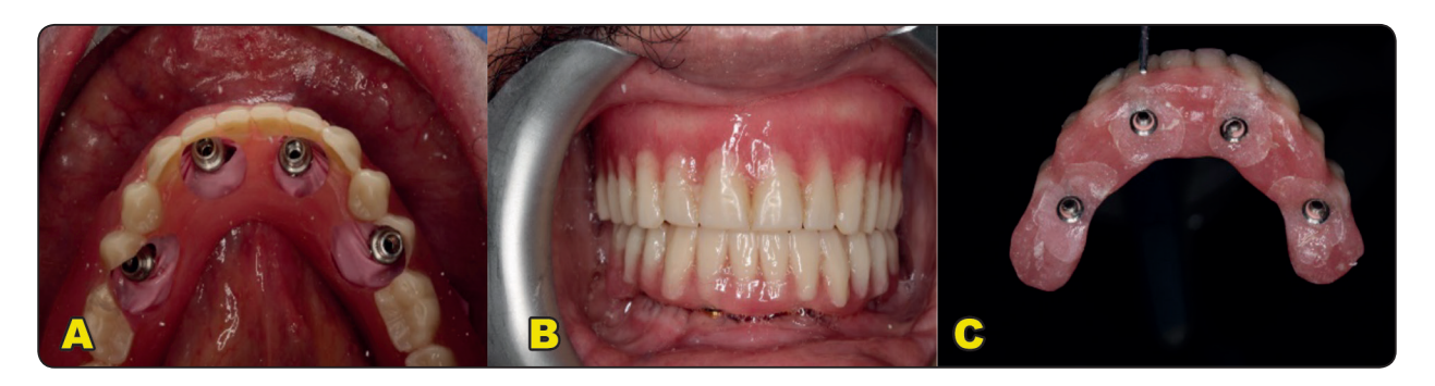
Fig. (2): a) the relived denture. b) patient occluding during pick-up procedure. c) finished denture after pick-up

Type and incidence of prosthetic complications for the immediately loaded prothesis for each group was evaluated in a six-month period. These complications included: loosening or fracture of the prosthetic screw, aesthetics, prosthesis mobility, fracture of the prosthesis and phonetics alteration.