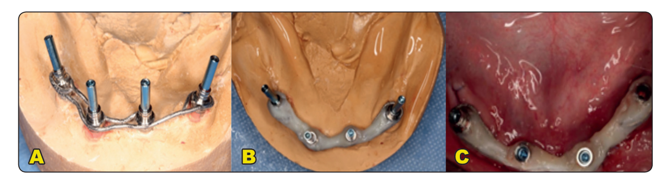
Fig. (3): a) abutments splinted with titanium wire. b) the wire augmented with flowable composite. c) the assembly intraorally.