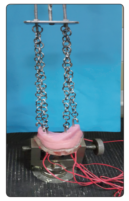
Fig. (3) Measurements of strain during overdenture dislodging

Four chains were attached to the to hooks at one end and to a metal plate at the other end<sup>37</sup>. The plate was connected to a testing device. Vertical dislodging force was exerted at 50 mm/min speed till complete dislodging of the overdenture from the model<sup>37,38</sup>. Measurement of periimplant strain ( \mu microstrain) at buccal and palatal strain gauges was made during the vertical dislodgment (fig3). The measurements we repeated three times and mean was used for statistical analysis.