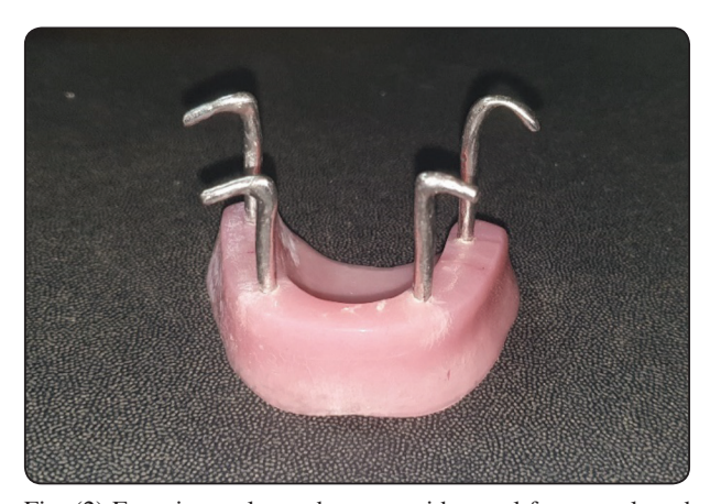
Fig. (2) Experimental overdentures with metal framework and acrylic resin rim