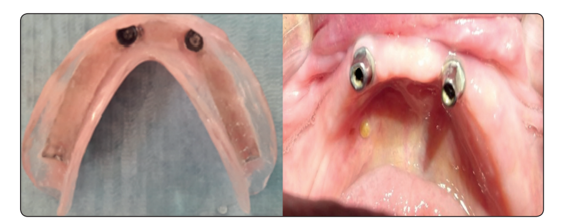
(a) The fitting surface of telescopic overdenture (b) the primary copings of telescopic crowns intraorally

Maximum Bite force: Patient was seated in an up-right position in the dental unit and instructed to bite on the force transducer bite sensor device (occlusal force – meter, GM10, Nagano Kieki.,