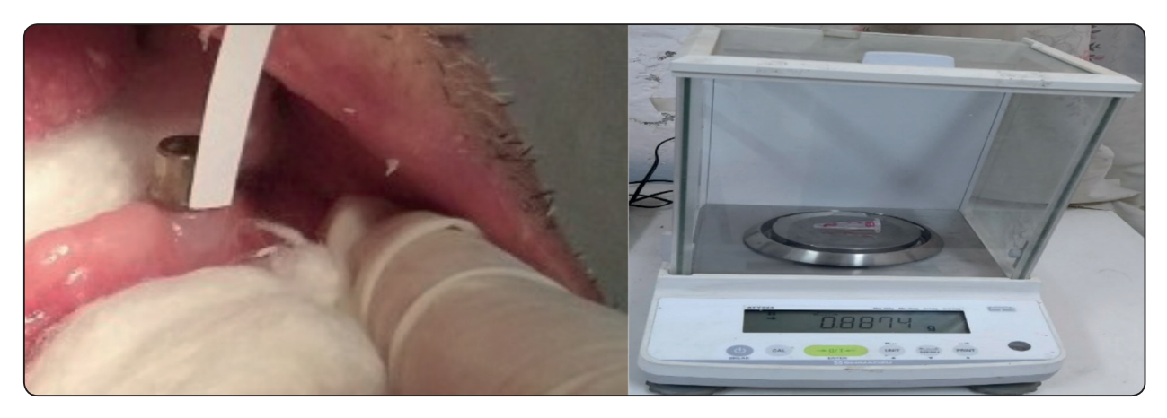
Fig. (3) evaluation of PISF

(Above: Whatman filter paper in the buccal crevice of the implant. Below: Eppendorf tube with strip on digital electronic balance after collection of the crevicular fluid)