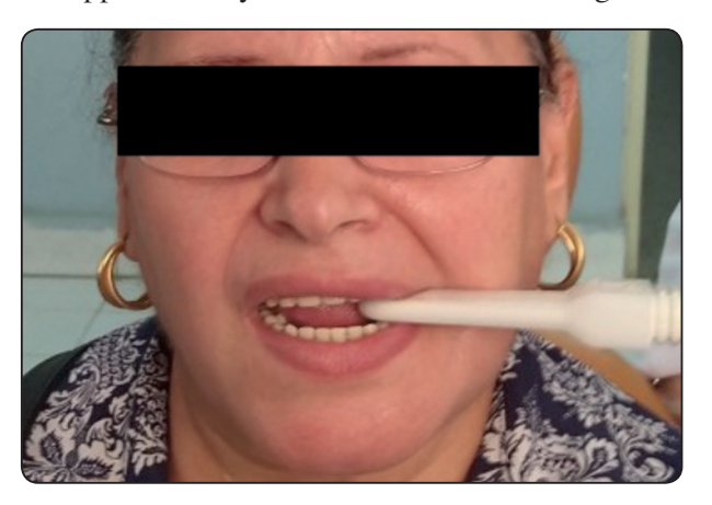
Fig. (2) Maximum bite force measurement

was done during the morning hours from 9 AM to 11 AM after isolating the implant of interest with cotton rolls and drying the external surface of the soft tissues with a gentle stream of air for 5 s. Whatman filter paper strips (Whatman International Ltd Maidstone, England) were utilized, inserted to a maximal depth of 1 mm (until mild resistance was encountered) in the buccal sulcus and kept in this position for 30s as recommended by a comprehensive technical review.49 Extreme care was taken to minimize mechanical trauma during sampling in order to avoid any effect on the volume of PISF. Any strip that had been contaminated with blood or saliva was discarded. The period between PISF collection and the paper strips transfer to the scale to was minimized to avoid the risk of evaporation. Each strip was weighted in an empty sterilized plastic Eppendorf tube using an electronic digital balance (Electronic balance ATY224, Shimadzu corporation, Kyoto, Japan) before collecting the sulcular fluid. The filter paper with the same plastic Eppendorf tube was reweighted after collection of PISF (figure 3). The difference between the two weights was considered to equal the volume or weight of the collected fluid as the specific gravity is approximately one, hence; volume = weight .^{50}