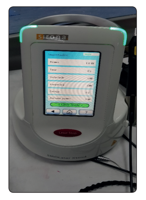
Fig. (1) Sirona Laser machine used in this study