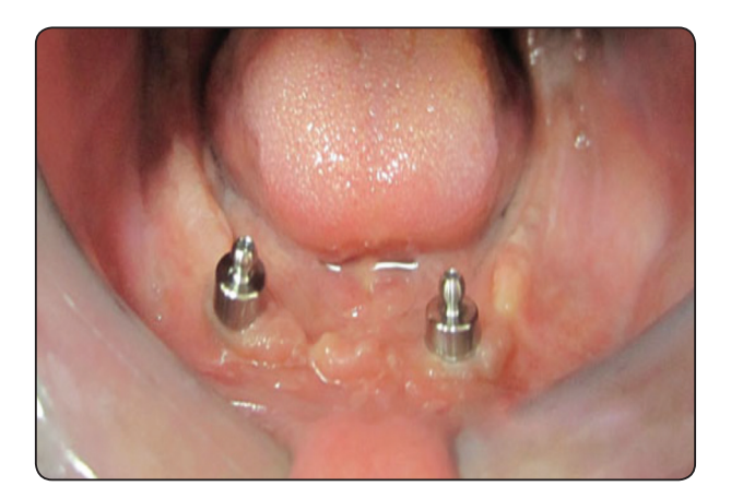
Fig. (3): Two ball attachments fitted onto implants.

female part was done by injecting cold-cure resin (Rebaron. GC Corporation. Tokyo. Japan) into the relieved areas. Denture was inserted into the patient mouth & patient was instructed to bite in maximum intercuspal position till complete polymerization of acrylic resin. Denture was then removed with the caps picked-up in its fitting surface, the plastic sleeves were removed and the denture was trimmed and polished and delivered to the patients. Fig (3).