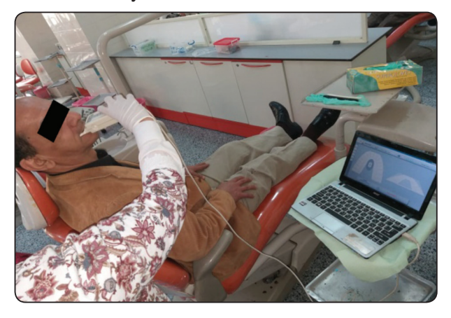
Fig (5) Patient biting on the sensor in maximal intercuspation