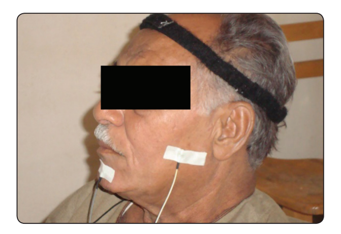
Fig (4) Electromyographic evaluation of the masseter muscle

The electromyography muscle activity (EMG) of the masticatory muscles was evaluated with surface electrodes attached over each muscle bilaterally. A conducting material was applied onto the patient's skin of the face under the electrode. The patient was instructed to sit in a relaxed position on a comfortable chair with his head erected and constant throughout the EMG evaluation. Surface differential active electrodes were placed on the skin over the belly of Masseter Muscle and the anterior belly of the Temporalis muscles bilaterally. The positions of the electrodes were detected by palpation; the electrodes were fixed with adhesive tape, with the silver bars. fig (4).