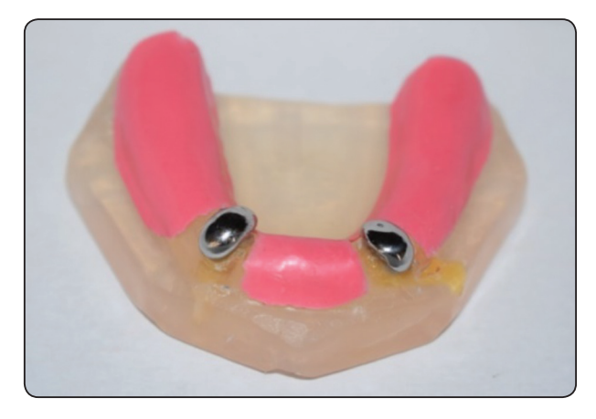
Fig. (1a) Model with Mini-Poll coping cemented

be placed in the fitting surface of the over-denture. Permanent soft silicon PROMEDICA<sup>®</sup> Germany, which can retain its elasticity up to 2 years, was placed in the formed spaces, and then the denture was seated on the model with the Mini-Poll copings cemented in place until complete setting of the silicon. The excess of the silicon was trimmed and