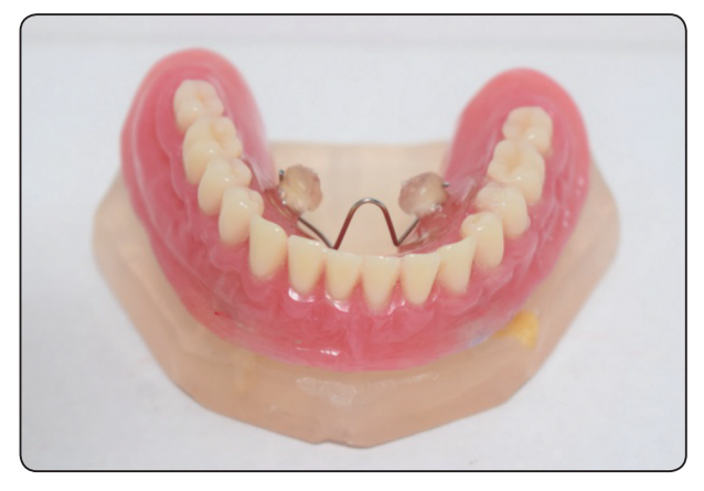
Fig. (1b) Denture with suction discs and orthodontics wire ligated

denture placed back on the model. The force gauge was hooked to the orthodontics wire, and pulling action was initiated, with the Mini-Poll coping to measure the resistance to tissue away movement and Pull forces. 100 readings were taken; data were collected and statically tabulated for both groups (Fig.1a-c).