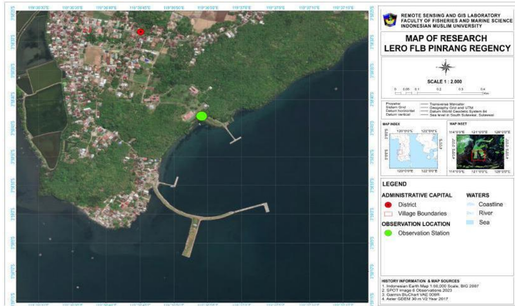
Fig. 1. Map of research location at Lero Fish Landing Bases (FLB)