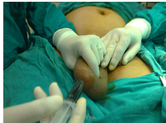
Fig 1. Scrotal subcutaneous injection of isosulphan blue before surgery.

After surgery, the patients were assessed by Doppler study at 3, 6 and 12 months for varicocele recurrence, hydrocele formation, atrophy, pain or other.