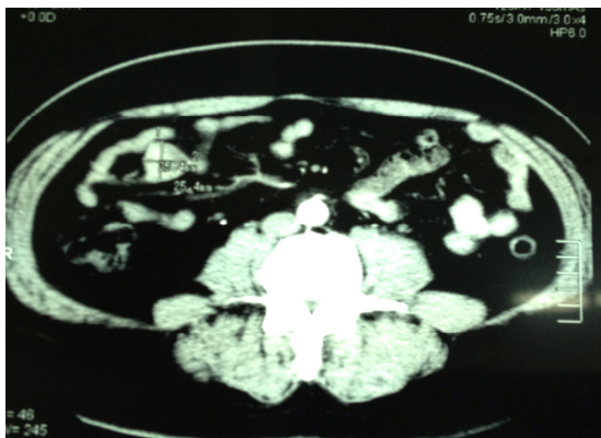
Fig 3. CT abdomen showing small intestinal GIST.