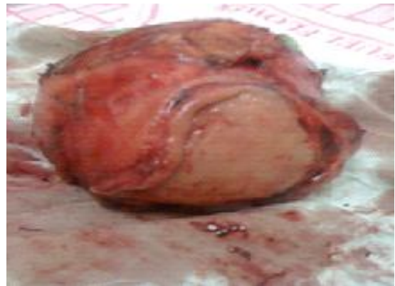
Fig 5. Resected gastric GIST (11cm in diameter).