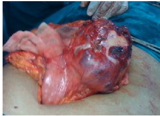
Fig 4. Gastric GIST.