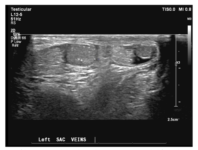
Fig. 1 An ultrasound examination of the scrotum revealed another small homogeneous tissue in the left scrotal sac measuring 0.67 \times 3.48 cm near the left testis

An ultrasound examination of the scrotum revealed bilateral testicular microlithiasis with left inguino-scrotal fatty hernia. It was noticed that there was another small homogeneous tissue in the left scrotal sac measuring 0.67 \times 3.48 cm (Fig. 1). An MRI of the abdomen and pelvis followed. This was to check for any signs of malignancy, but it revealed no additional abnormalities. An alpha fetoprotein level was taken, as it may be a marker of malignancy; however, this was also normal.