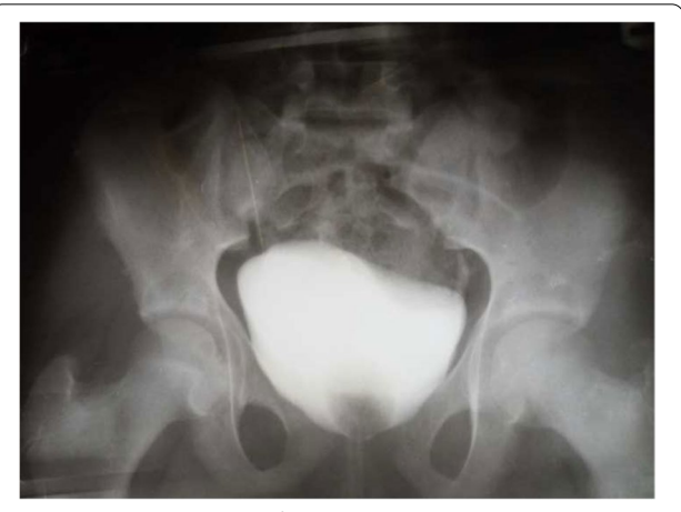
Fig. 2 Micturating cystourethrogram

neck, double-breasted urethroplasty,sphincteroplasty, clitoroplasty, labioplasty, and monsplasty (Fig. 3A–D). The urethral catheter was left in situ for 14 days. She did well post-operatively (Fig. 4), achieved continence, and has remained dry up to the last follow-up visit. She is currently 4 ½ years post-surgery and is fully continent of urine. She is now married and has delivered a 1-year-old female child (per vaginum).