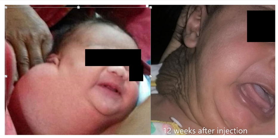
Fig. 2 Pre and post treatment photographs in Group B (Bleomycin)

and 2). In group A, 86.7% of participants showed excellent responses, whereas in group B, 60.0% of participants showed an excellent response. The degree of response was measured clinically by measuring tape. These differences in response between groups were marginally statistically significant as p=0.049 (chi-square test) (Table 3).