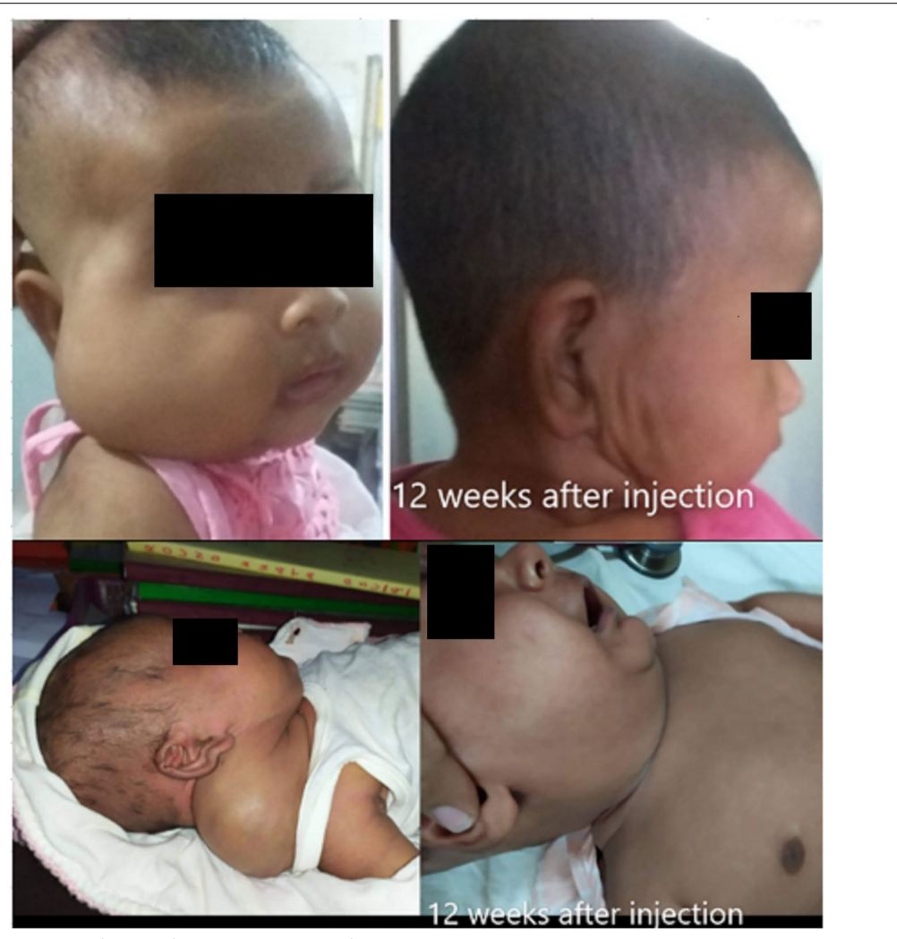
Fig. 1 Pre and post treatment photographs in Group A (Doxycycline)

There was a significant reduction in the median size of the lesion in both groups (Table 2) and poor response means response category <25% [6] (Figs. 1