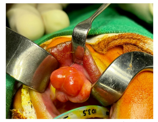
Fig. 2 Per operative picture showing the mass arising from the maxillary alveolar ridge

lesion and more prevalent in females and Caucasians [5–7]. It can be picked up during prenatal imaging as early as 26 weeks. It presents as an irregular, lobulated, rubbery soft tissue mass of varying sizes. A large size may be the reason for polyhydraminios affecting fetal deglutination. Postnatally, it may cause difficulty in feeding [1]. The mass is believed to originate from the undifferentiated mesenchymal cells, pericytes, fibroblasts, odontogenic epithelial, and smooth muscle cells. The diagnosis is usually clinical and confirmed by histopathology. Congenital