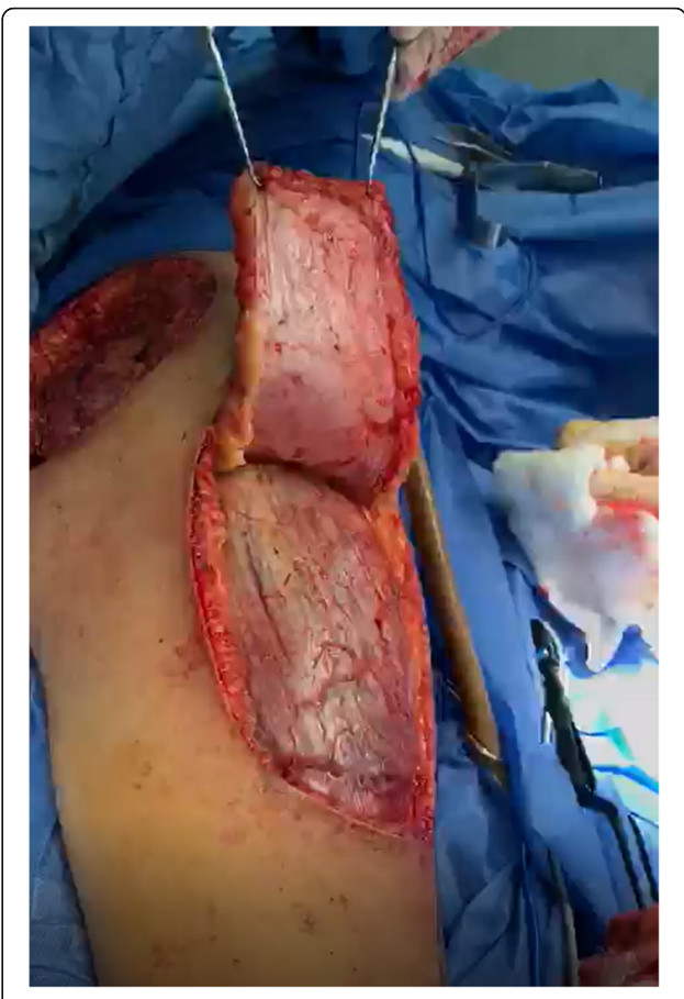
Fig. 6 Proximal dissection of the flap on the vastus lateralis muscle, in the subfascial plane

Lymphatic malformation appears more frequently in children under 1 year, slightly diminishing its incidence to 5 years, and gradually decreases to 16 years [15]; coupled with this and its location (lower region of the gluteus), the case presented here is an extremely unusual form of lymphangioma, being more frequent in the head, neck, and armpit. As previously mentioned, LC in the genital or perianal areas are rare and have been reported more commonly in women than in men. Akhavan et al. [11] after an exhaustive review found only 35 cases