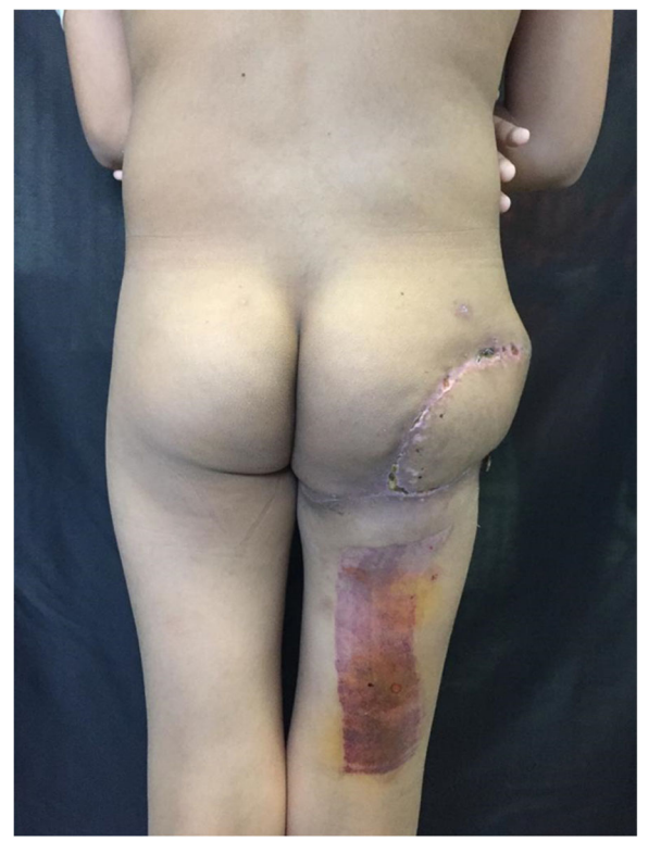
Fig. 10 Image of the patient at 14 days of recovery. Right gluteus