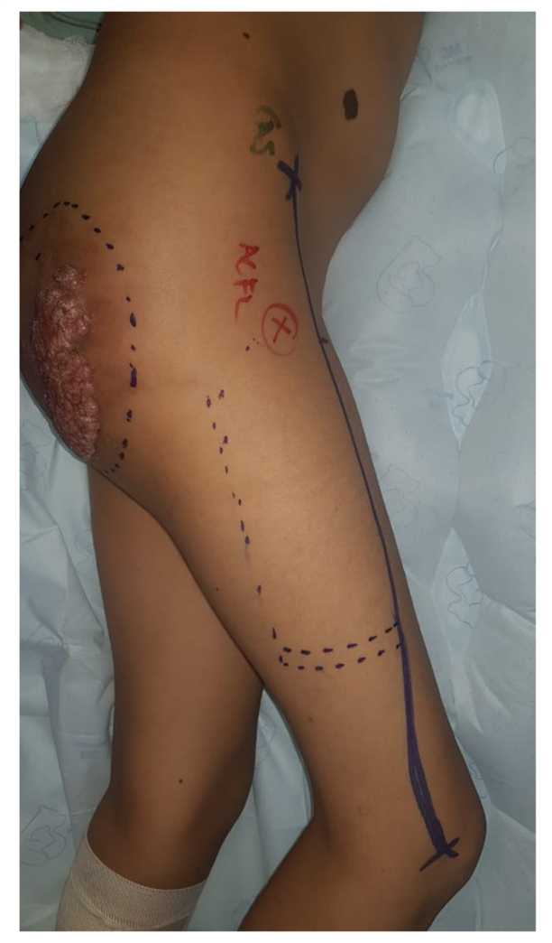
Fig. 4 Reference points

If a functional transfer is required, a branch of the superior gluteal nerve is exposed and dissected between the gluteus medius and gluteus minimus muscles in its proximal portion, on the posterior surface and the deep plane of the hilum. The vascular branches of the pedicle are identified and ligated for