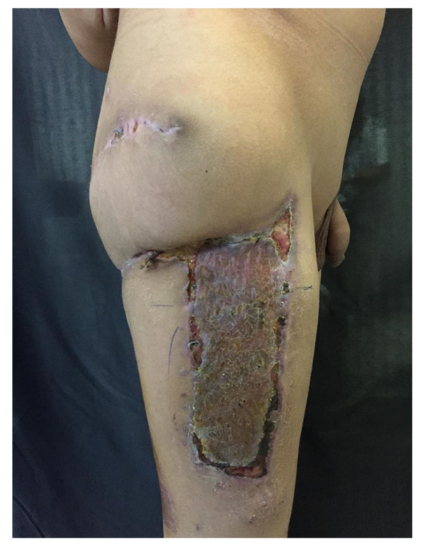
Fig. 9 Image of the patient after 14 days of recovery. Right thigh