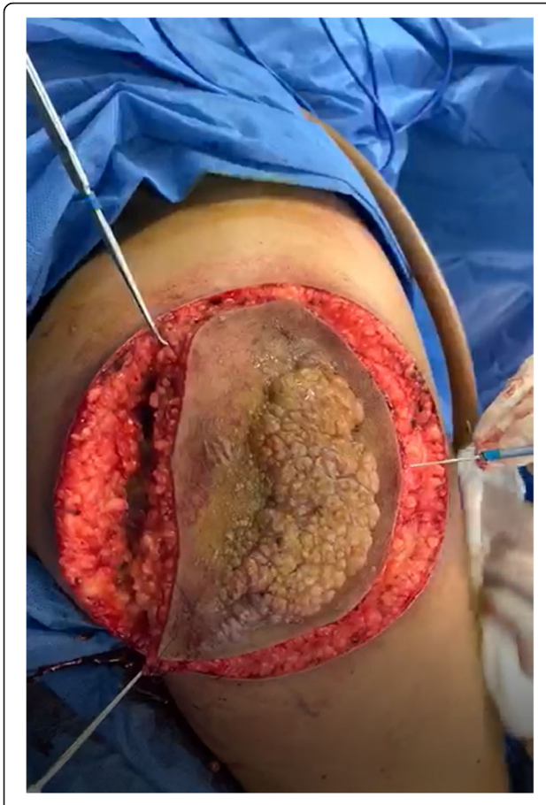
Fig. 7 Gluteal dissection

lesions, which involved a larger tissue area. It has been described that, for cases, such as the one presented here, the surgical modality presents a success rate higher than 75% [17].