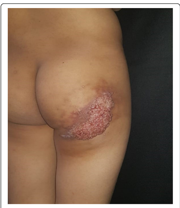
Fig. 1 Macrocystic lymphatic malformation in the right buttock with herpetiform characteristics

A biopsy of the lesion was taken, with the following histopathological report: hyperkeratotic epidermis with focal acanthosis, dermis with dilated vascular lumens, and eosinophilic material inside suggestive of macrocystic lymphatic malformation [12]. The department of vascular surgery and hemodynamics performed a diagnostic angiography, observing the right hypogastric artery with multiple dependent and collateral branches towards the gluteal region. Subsequently, a magnetic resonance was performed (Figs. 2 and 3), where multiplanar acquisitions are made at the level of the right thigh, in T1 and T2 sequences with fat suppression, reporting a lesion compatible with lymphatic malformation in the subcutaneous cutaneous plane of the right gluteal region, without data of extension towards deep planes, without evidence of prominent vascular structures or calcifications that suggest phleboliths. The muscular structures were found intact, as well as both femurs and aponeurotic tracts. Finally, the 20 × 10 cm lesion was cleavage, with margins of 2 cm and the vascular bed was ligated.