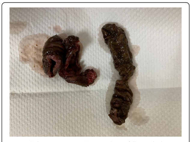
Fig. 2 Tubular structure passed out on day 6 of illness which resembled necrotic small bowel % \left[ \left( {{{\mathbf{F}}_{i}}} \right) \right]

The earliest descriptions of intussusception could be found in the Hippocratic Writings [5]. Bonetus in his volume Sepulchretum (1679) complied the autopsy findings of ileus in which descriptions of intussusception were made by Colombus (1494 to 1557), Barbette (1629–1557), and Morgagni (1682–1771) [6]. John Hunter (1728–1793) can be credited for the first detail description of the pathological features of intussusception. During this period of Renaissance, the term ileus was used to describe midgut volvulus, intussusception,