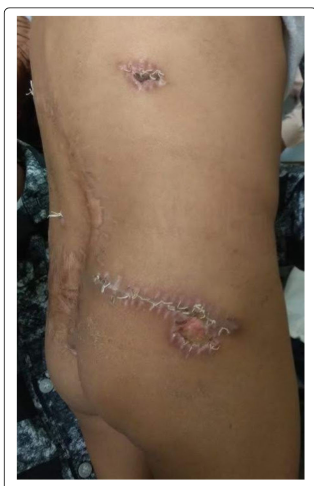
Fig. 3 Follow up image after excision of the secondary lesion showing healed scar

tumors as a variant of neurofibromas (storiform neurofibroma) [1]. Bednar tumor is a variant of DFSP containing abundant melanotic pigment. It is a disease of middle age third and fourth decade and is rarely described in children and even rarely in neonates (congenital variant) [2, 3]. Our case was peculiar, as the parents had noted the pigmentation since birth and was diagnosed as Bednar tumor at the time of presentation to the hospital.