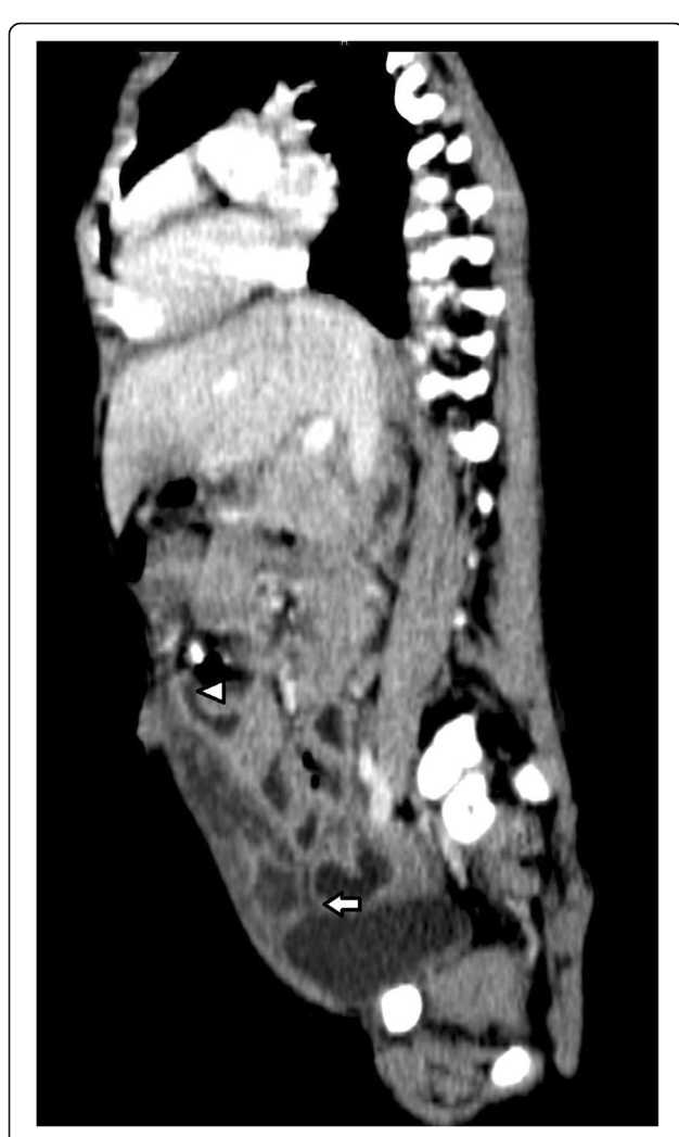
Fig. 1 Sagittal view of the abdominal CT showing multiloculated urachal abscess extending from the bladder dome (arrow) to the umbilicus (arrow head)

Abdominal ultrasound (US) showed a heterogeneous multiloculated cyst, situated immediately behind the lower anterior abdominal wall, extending from the umbilicus downward to involve the right paramedian aspect of the urinary bladder dome. The findings were suggestive of urachal remnant abscess measuring 5.5 \times 3 \times 2 cm. The US also showed, incidentally, a single left kidney, confirmed by a computed tomography (CT) scan; in addition, it revealed segmental butterfly anomalies of the thoracic (Figs. 1 and 2), L1, and S1 (not shown) vertebrae. The family was counseled regarding the clinical findings and the treatment options, with surgery being the optimal intervention. They were also informed about all possible complications, after which they signed an informed consent to proceed with the treatment plan.