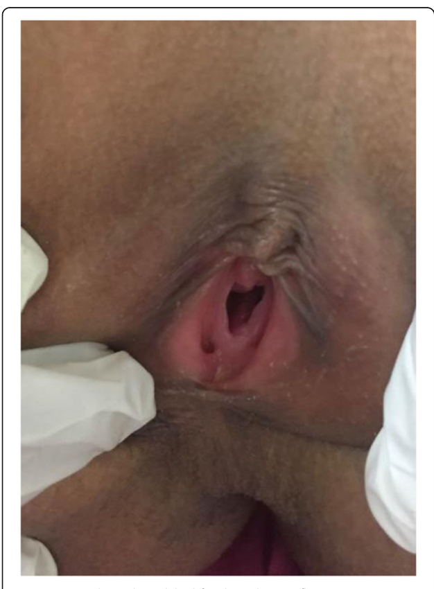
Fig. 1 Perineal canal: anolabial fistula without inflammation

They were reviewed with respect to clinical presentation, examination, and management. All patients were evaluated for associated anomalies. Patients who had perineal inflammation underwent diverting sigmoid colostomy at the first stage. They were treated with intravenous antibiotics and sitz bath and were reviewed after 12 weeks. A distal loopogram was done which revealed persistent fistula in the perineum. These patients were subjected to definitive repair once the perineal inflammation was controlled, and colostomy reversal was done at the third stage, after 12 weeks. Patients who presented with the perineal canal (without any inflammation) underwent a two-staged procedure which involved definitive repair with diverting sigmoid colostomy initially, followed by colostomy reversal after 12 weeks. All cases