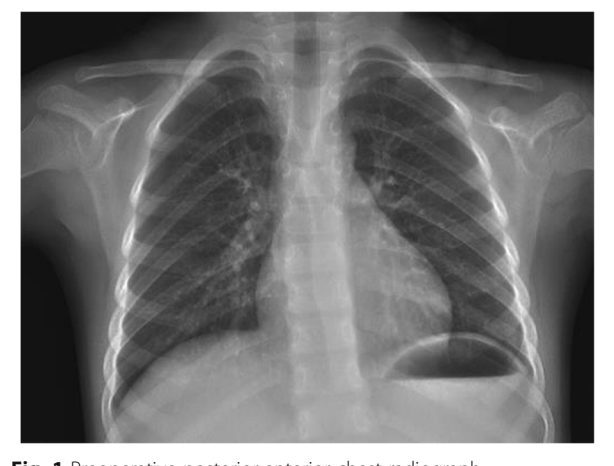
Fig. 1 Preoperative posterior-anterior chest radiograph