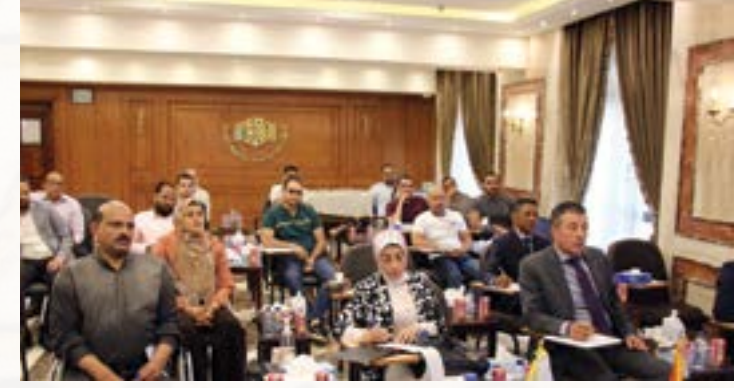
Members of the training course for students of determination

In light of the ACA's actions against corruption, namely Aligning with National Bodies, the EACA held a training course for Military