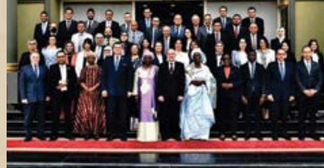
«The visit of a delegation from the Advisory Council of the African Union to the National Academy for Combating Corruption to learn about the vision, mission, and objectives of the academy and to discuss ways of cooperation and exchanging experiences.»