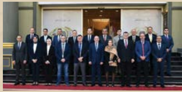
A workshop was held on combating illegal migration and human trafficking for attachés at the embassies of the Netherlands, Hungary, Germany, Spain, and France. The workshop reviewed national efforts in combating illegal migration and human trafficking, and the several successes achieved in this field were discussed

Three training programs were held at the headquarters of the Academy for Government Experts of the state parties of the Arab Convention for Combating Corruption, with the participation of 134 experts from law enforcement agencies in several Arab countries. The aim was to provide participants with knowledge, skills, and attitudes related to activating relevant international and regional agreements, and to enhance international and regional cooperation in the prevention and combating of corruption. The training was coordinated with the Arab League, the United Nations Office on Drugs and Crime, and the Saudi Anti-Corruption Authority (Nazaha)