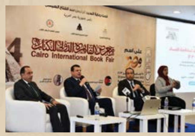
«The National Academy for Combating Corruption participated in the Administrative Control Authority's booth at the Cairo International Book Fair, and honored the young participants in managing the booth.»