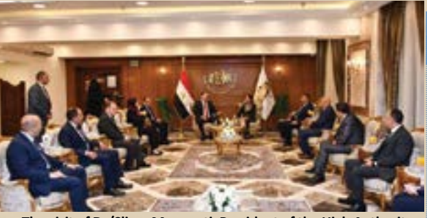
The visit of Dr/Slima Massarati, President of the High Authority for Transparency and Prevention of Corruption in Algeria, and the accompanying delegation to the National Academy for Combating Corruption to discuss future cooperation in areas of shared training and education interests, as well as exchanging expertise in the preparation, monitoring, and implementation of anticorruption strategies