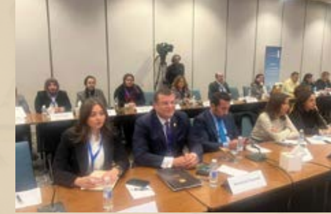
Participation in the regional conference to launch the "Leadership Alliance for Integrity and Anti-Corruption in the Arab Region" in Jordan