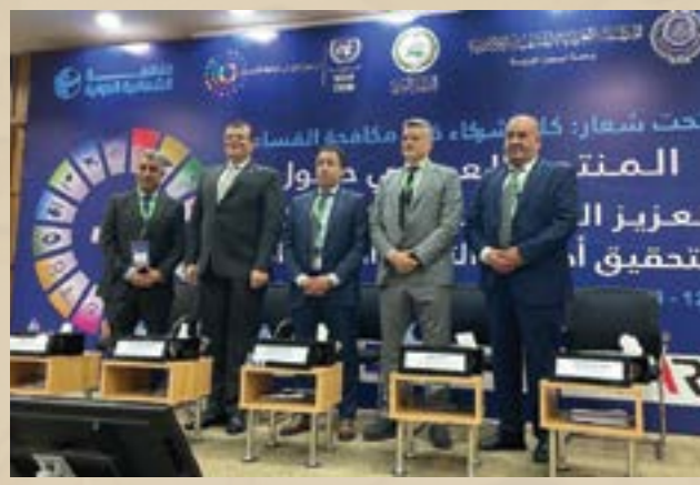
Participation in the Arab Forum on "Enhancing Transparency and Good Governance to Achieve Sustainable Development Goals", organized by the Arab Administrative Development Organization - League of Arab States in collaboration with the Arab Parliament, UN ESCWA, the United Nations Economic and Social Commission for Western Asia, and in cooperation with the International Transparency Organization.

Three training programs were held at the headquarters of the Academy for Government Experts of the state parties of the Arab Convention for Combating Corruption, with the participation of 134 experts from law enforcement agencies in several Arab countries. The aim was to provide participants with knowledge, skills, and attitudes related to activating relevant international and regional agreements, and to enhance international and regional cooperation in the prevention and combating of corruption. The training was coordinated with the Arab League, the United Nations Office on Drugs and Crime, and the Saudi Anti-Corruption Authority (Nazaha)