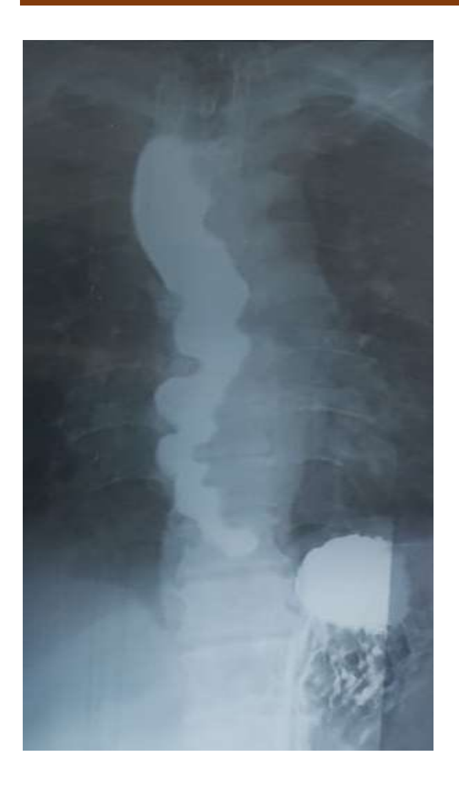
Fig 2: Barium swallow showing the corkscrew appearance