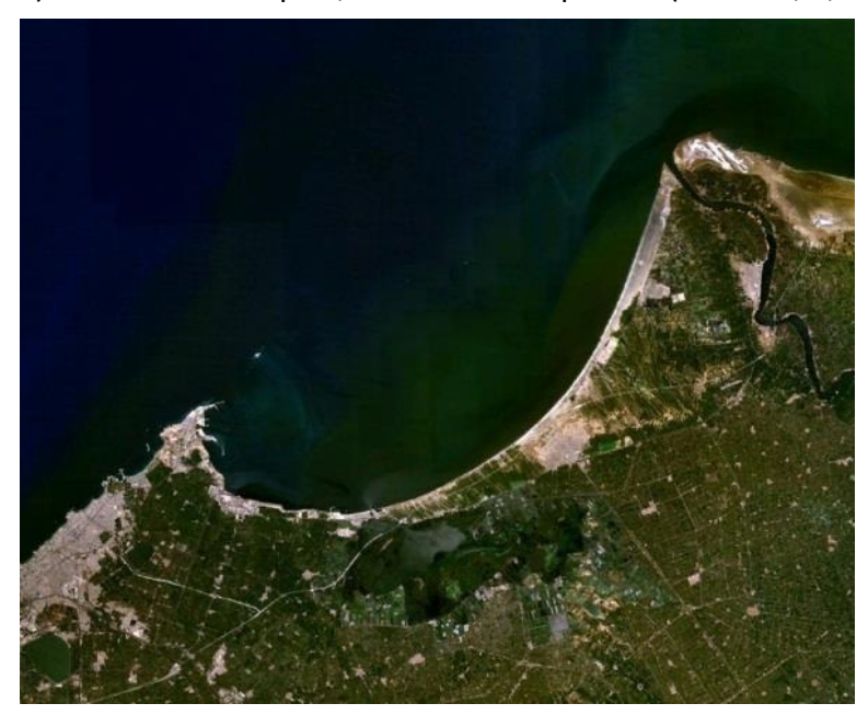
Fig. 1 - Satellite View of Abukir Bay.

Abukir Bay is a large bay on the Mediterranean Sea near Alexandria, located between the Rosetta mouth of the Nile and the town of Abukir. It is characterized by its rich submergedheritage from the Pharaonic era to the modern time. In 1798, it was also the site of the battle ofthe Nile between the British Royal Navy and the Navy of the French First Republic by Napoleon. Its submerged heritage can be divided into two parts: the first part, the Sunken Cities (Canopus, Menouthis, Heracleuim) and the second part, the fleet of Napoleon (Darwish, I., 2017).