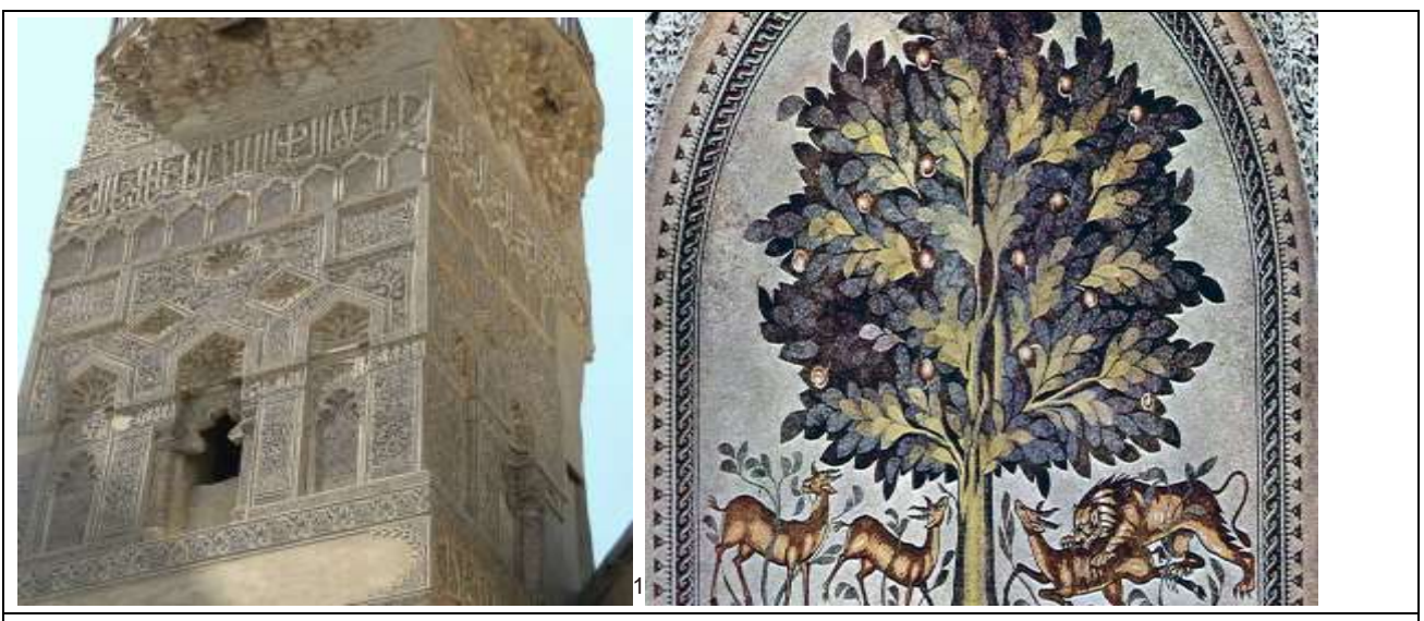
Figure (3) Part of dome of the Mosque of Mohamad Ibn Kalawun - the largest mosaic mural in the Middle East and the world, one of the pearls of the Umayyad

Murals of the Islamic era: The murals of the Islamic era were designed uniquely from other arts that preceded it, through the philosophy of the Islamic faith. The Muslim artist mastered the use of wall decorations (which do not contain drawings), digging and grafting with other materials, so the art of securitization (arabesque) and using of intertwined geometric shapes, coordination and drafting them in exquisite artistic forms, in addition to plant motifs with their wavy branches, calligraphy motifs, specifically the Kufic and Naskh calligraphies.