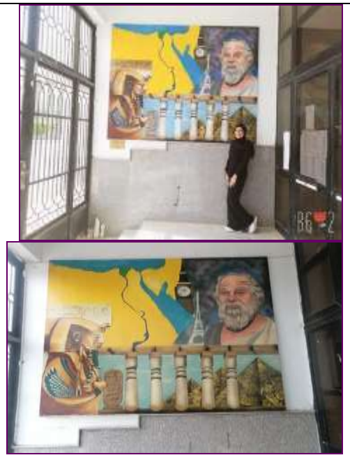
Figure (5) two frescoes at the entrance to the Faculty of Arts