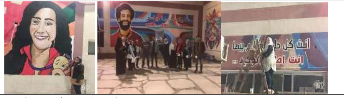
Figure (8) murals, Badr Park

Experiment Five (8) First: Characterization: