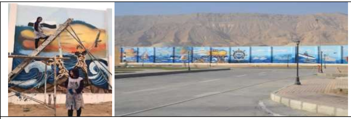
Figure (6) the mural of the maritime history of Egypt

and the strength of linear rhythms achieved movement, coherence and chromatic balance.