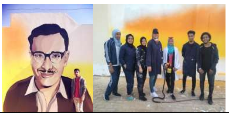
Figure 9: The 900-meter mural of wall of the Suez Stadium