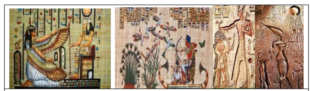
Figure (2) Designs of some murals in the Ancient Egyptian civilization

The mural painting of the ancient Egyptians played an important role in conveying the idea of religion and bringing it closer to the minds of people and creating a spiritual atmosphere that helps in performing the rituals. Ancient Pharaonic temples and tombs were decorated with drawings with themes that represent life aspects and religious rituals.