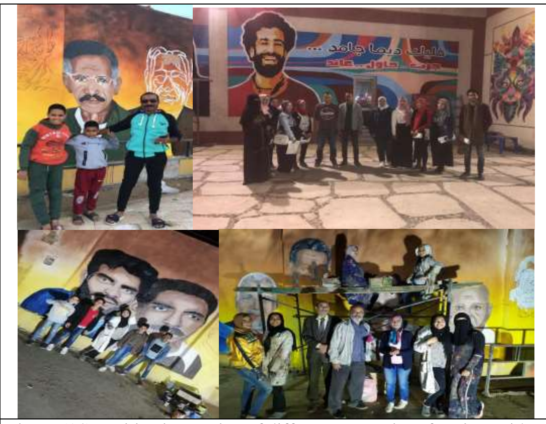
Figure (14) Positive interaction of different categories of society with the murals

Culture for the individual is related to knowledge, but culture for society is related to social characteristics far from being cognitive because it results from the individual and society's perception of science and knowledge in various areas of life.