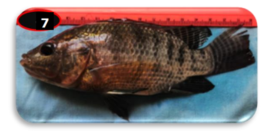
Fig. (7): Experimentally infected O. niloticus by M. luteus showing excessive black coloration on the skin and fins.