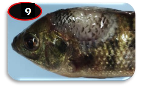
Fig. (9): Experimentally infected O. niloticus by M. luteus showing scale loss and skin ulceration.