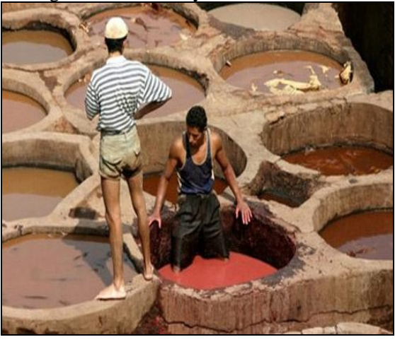
Figure 5 - Polluting Tanning Industry

Tannery processing impacts negatively the environment and the health risks among the workers employed in the leather tanneries. Various chemicals are used during the soaking, tanning and post tanning processing of animal skins. The chemical used consists of sodium hydrosulphide and chromium sulphate both are known to be carcinogenic agents. Fig.(5) shows cheap labors working in a dirt industry.