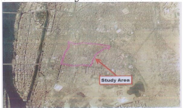
Figure 8 -Studied area of Magra El Oyoun location

The Centre for Environmental Hazard Mitigation, of Cairo University undertook a preliminary study ref. [2], consisting of thirty boreholes from 2.5 to 8 m depth were performed for subsurface reconnaissance purpose. A numerical 3-D mathematical model was developed to simulate the underground water movement.