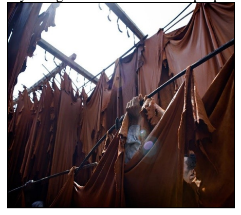
Figure 6 - Air drying of Leather

The accumulation of these pollutants and the dumping of untreated tannery wastes are also a major source of marine pollution: fish and shell fish species, keeping in mind that the river Nile which is the main river of the country is very near to the old tanneries location. After these long decades of contamination in the air, water and soil, the Government decided to move the tanneries site away using the area for touristic purpose.