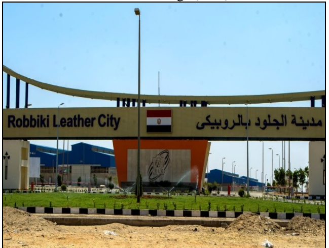
Figure 3 - Entrance of Robbeky leather city

The new ideal modern area will cover a site of 350 acres and will be developed to incorporate a decent residential district, in addition to commercial and recreational areas fig. (3&4). This indus-