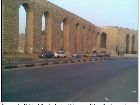
Figure 1 - Behind the historical Cairo wall lies the tanneries

The present study focuses on an existing tannery that dates back to about 500 years, located in a crowded area of old Cairo, a city of more than 15 million inhabitants. The Egyptian Government decided to transfer this old tannery of Magra El-Oyoun Wall fig.(1), to a new industrial zone in Robbeky fig.(2), a neighborhood North-East of Cairo, to cope with the current booming worldwide market for leather.