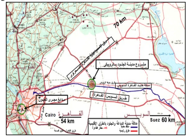
Figure 2 - Map showing the location of the new Robbeky City